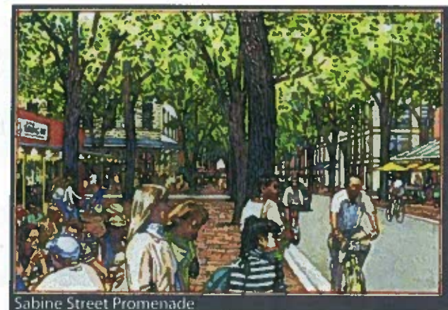
Sabine Street Promenade