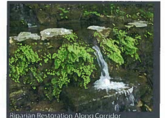
Riparian Restoration Along Corridor