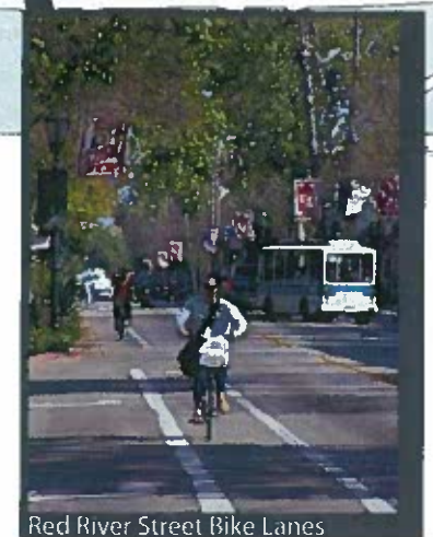
Red River Street Bike Lanes