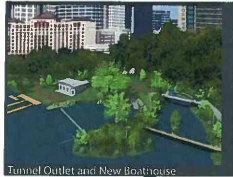
Tunnel Outlet and New Boathouse