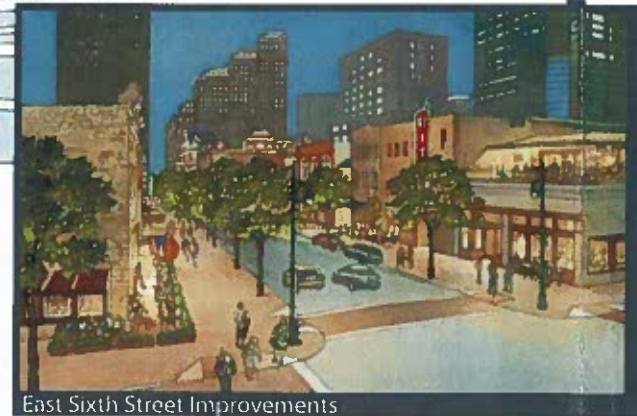
East Sixth Street Improvements