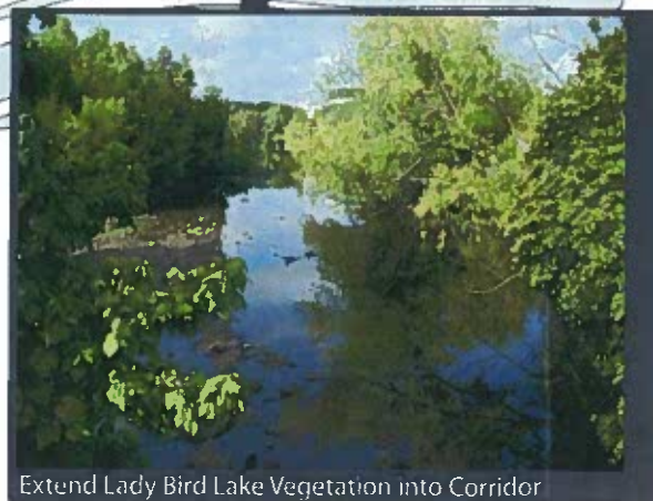
Extend Lady Bird Lake Vegetation into Corridor