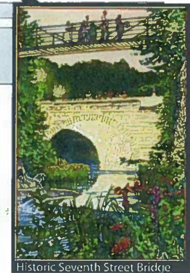
Historic Seventh Street Bridge