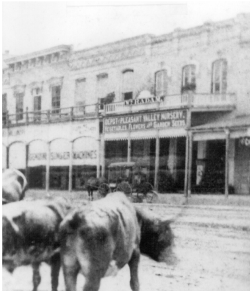
ca. 1886 photograph of the three buildings (from left): 911, 909, and 907 Congress Avenue