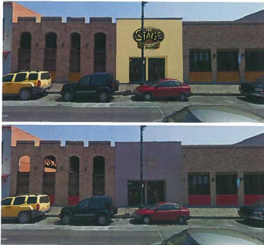
THE STAGE ON SIXTH 508 AND 510 EAST 6TH STREET SIGN PROPOSAL AUSTIN TX 78701 8-15-10