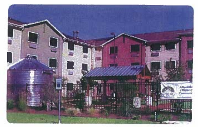
Spring Terrace (renovation of Hearthside Extended Stay Hotel)