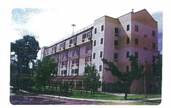
Skyline Terrace (renovation of a former Ramada Inn)