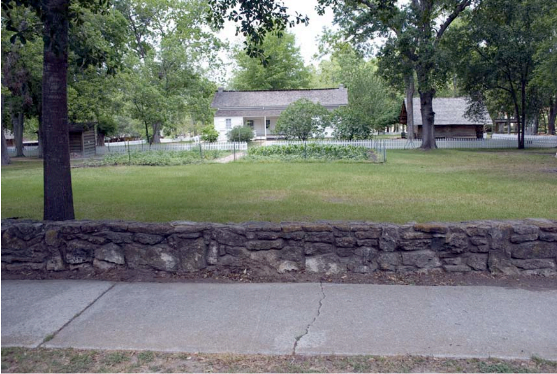
Figure 4. View from the rear of the Sam Houston House with stone wall in foreground. Huntsville, Texas.