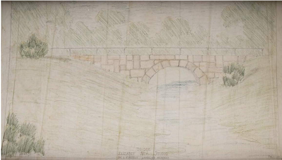
Figure 1. Sketch by Jac L. Gubbels of a proposed bridge over Waller Creek at the Elisabet Ney Museum. The bridge was never built. Architecture files, Austin History Center. Used by permission.