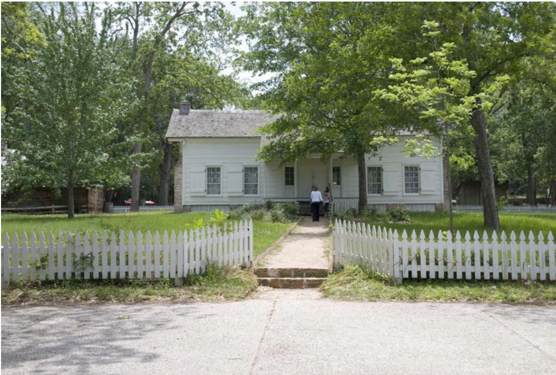
Figure 5. View of the front façade of the Sam Houston House.