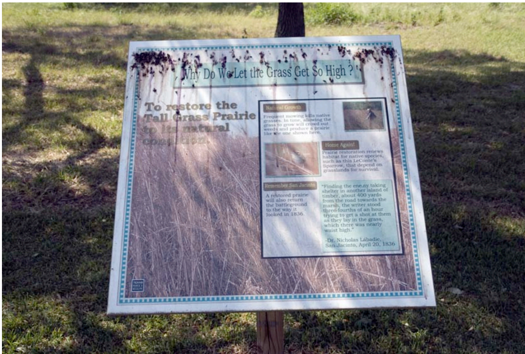
Figure 6. Signage explaining tall grass prairie restoration at the San Jacinto Battleground State Historic Site. Note: Signs should be cleaned regularly if placed under trees.

Signage – While the landscape restoration is in progress, it could be useful to install informational signage explaining what is happening on the site. Texas Parks & Wildlife Department is restoring the tall grass prairie at the San Jacinto Battleground State Historic Site and has installed signs throughout the park to explain the project (Fig. 6).