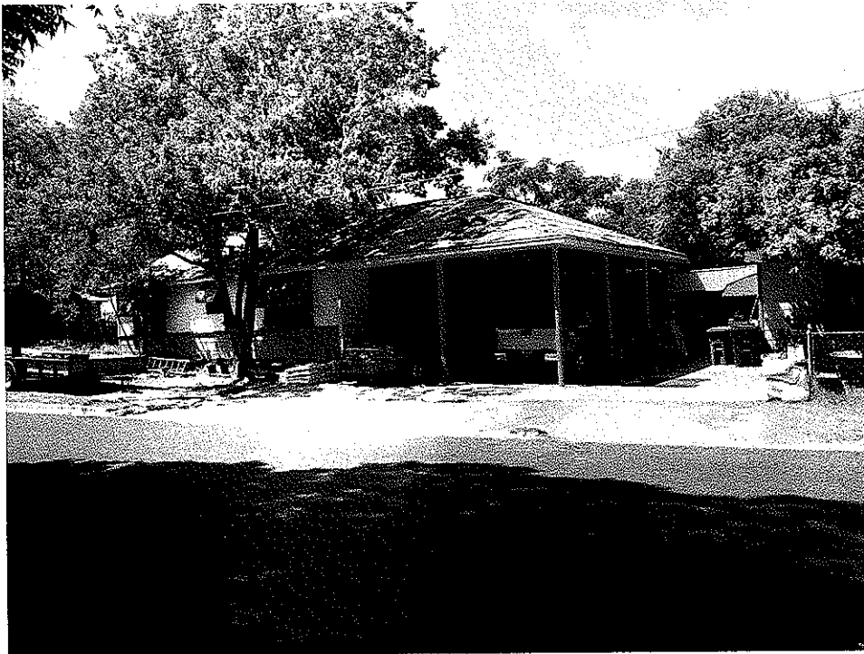
July 3, 2011