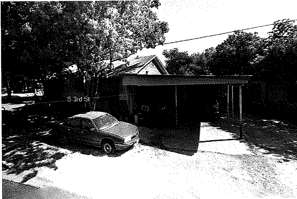
Before from Google Earth