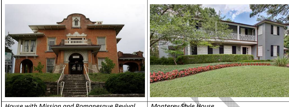
House with Mission and Romanesque Revival Stylistic Influences.