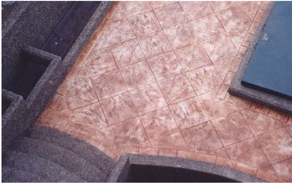
Stamped colored concrete