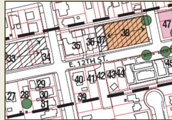
Image from McCann Adams Studio, 2011 “Inventory of Properties & Businesses”