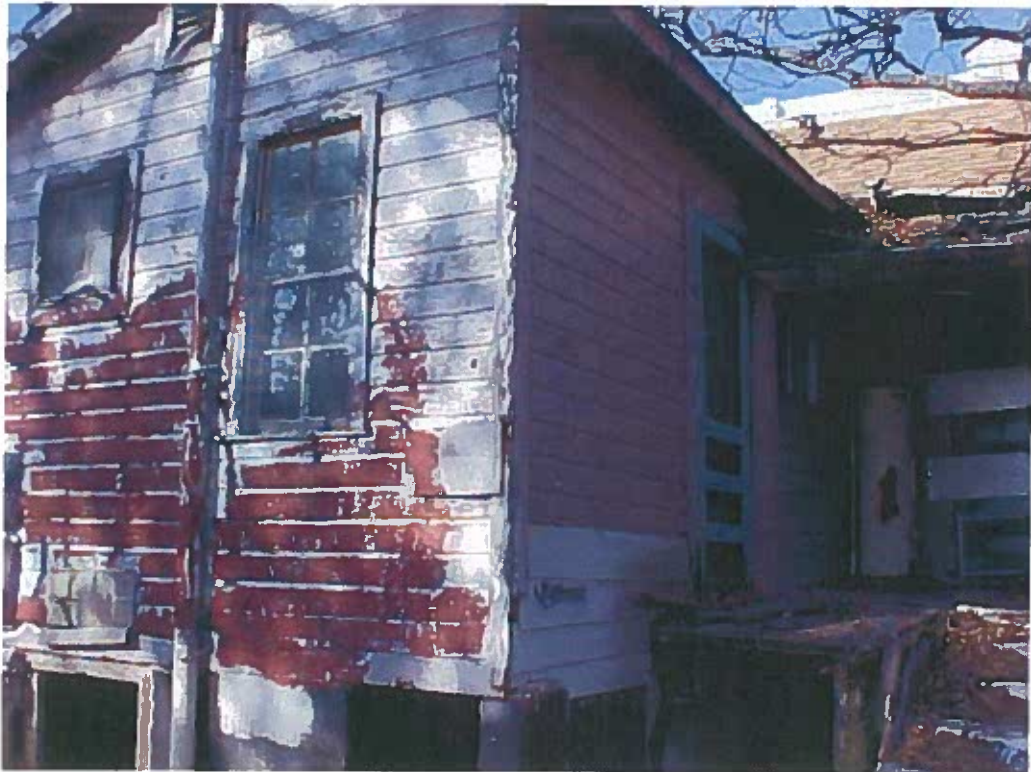
623 Wood Street (rear)