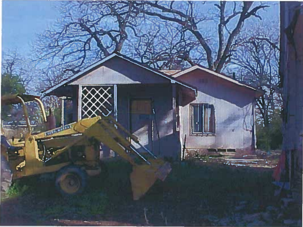
623 Wood Street