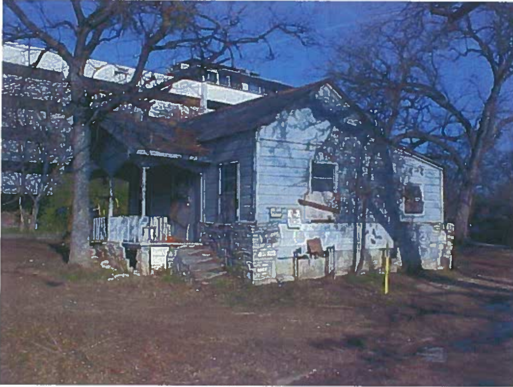
702 Wood Street