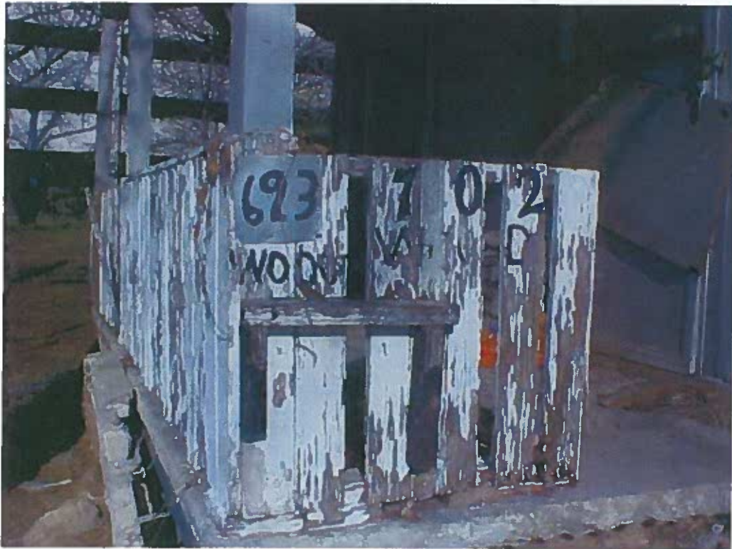
Front porch of 702 Wood Street showing both addresses