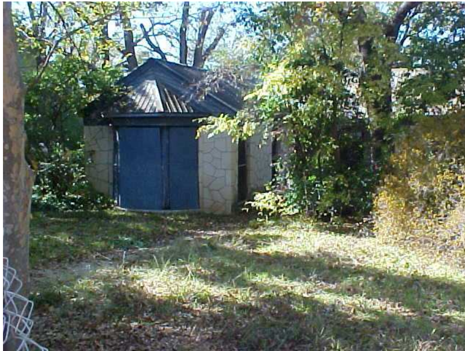
2100 Elton Lane ca. 1939