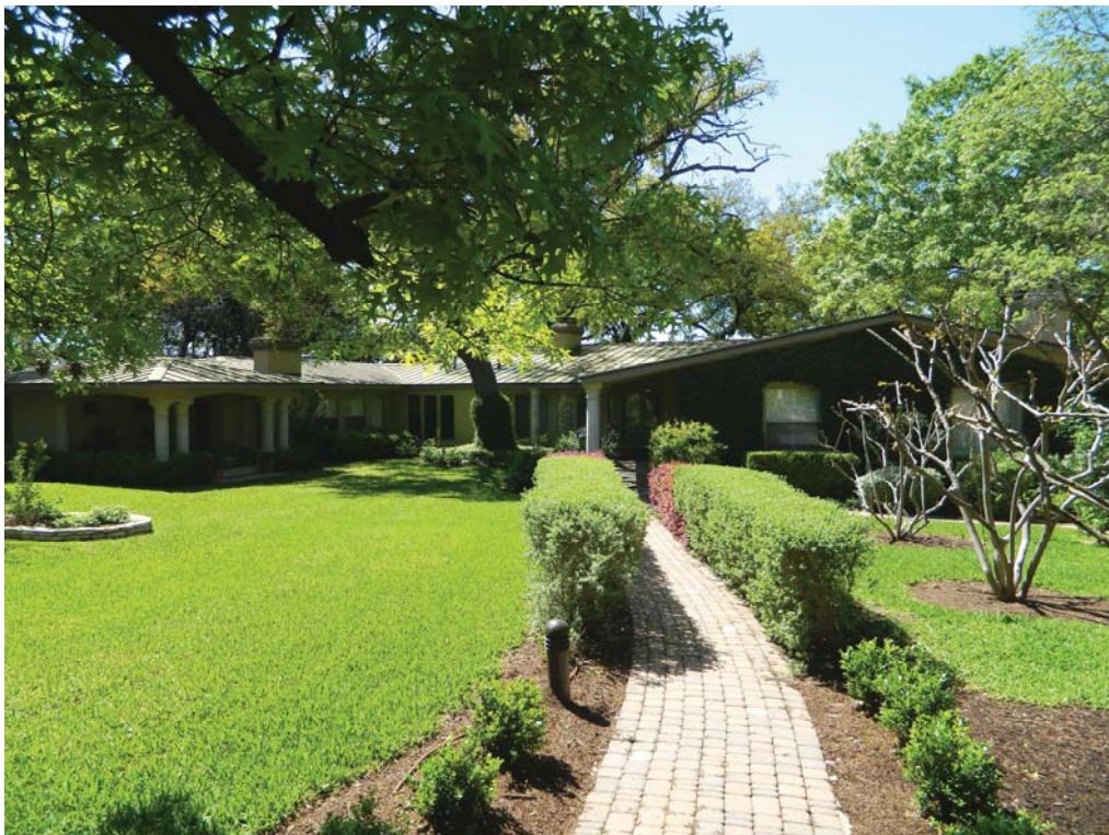
Heath House, 1808 Vance Circle (1948)