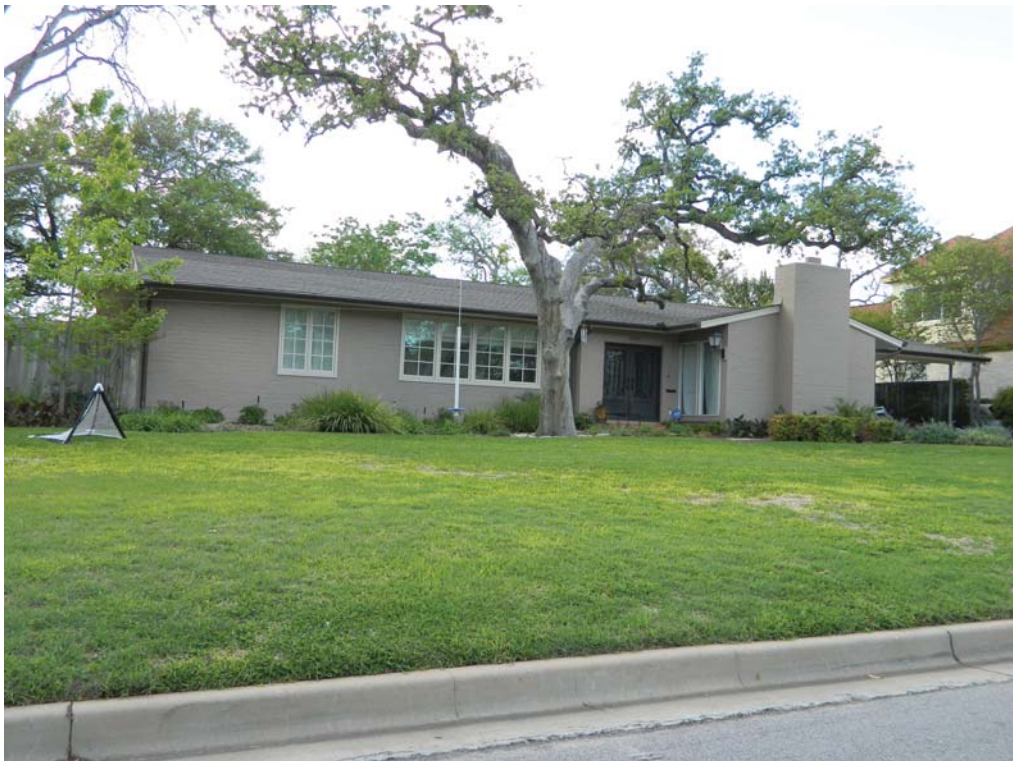
Steinhauser House, 2604 St. Anthony Street (1951)