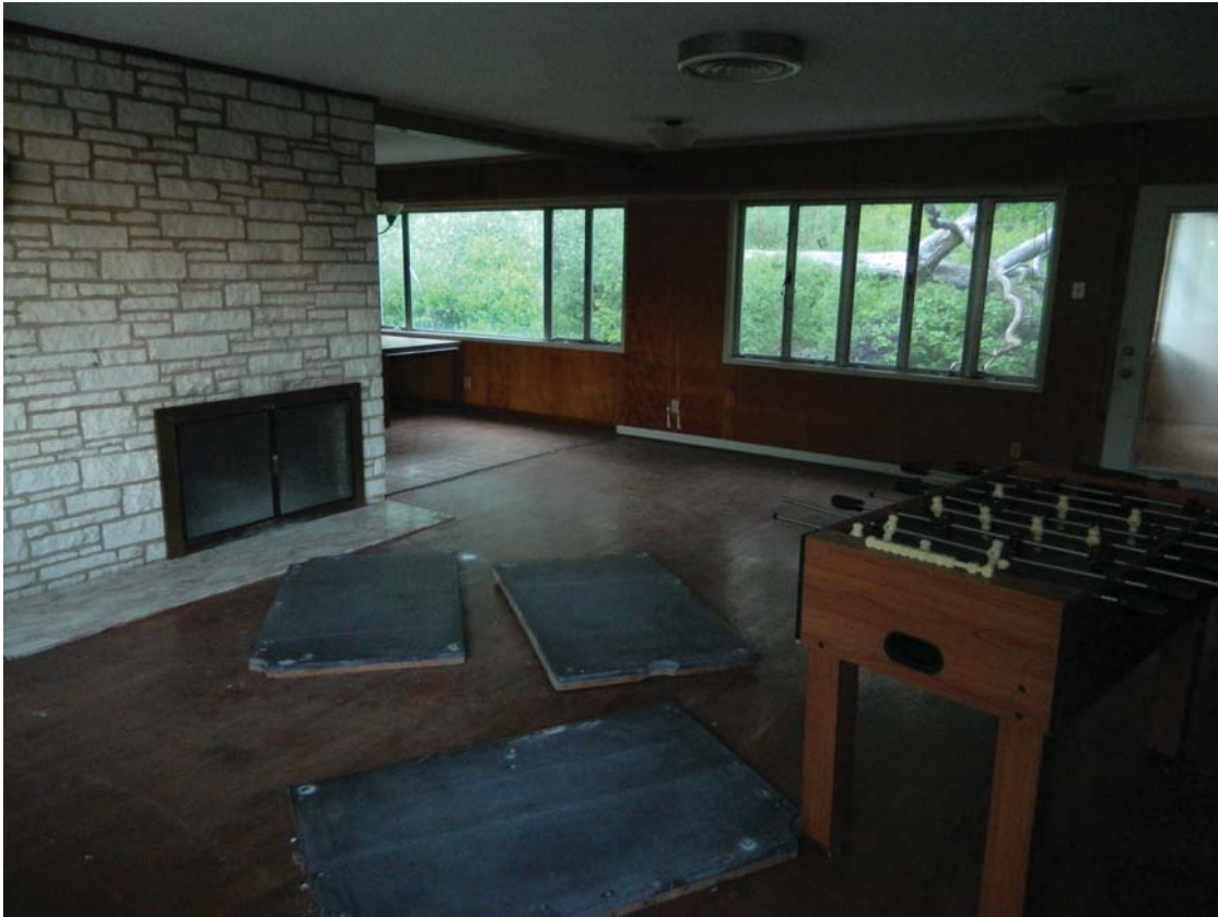
Interior shot (through a window) showing the stone fireplace, back wall of windows, and the wooded hillside beyond, comprising the back yard.