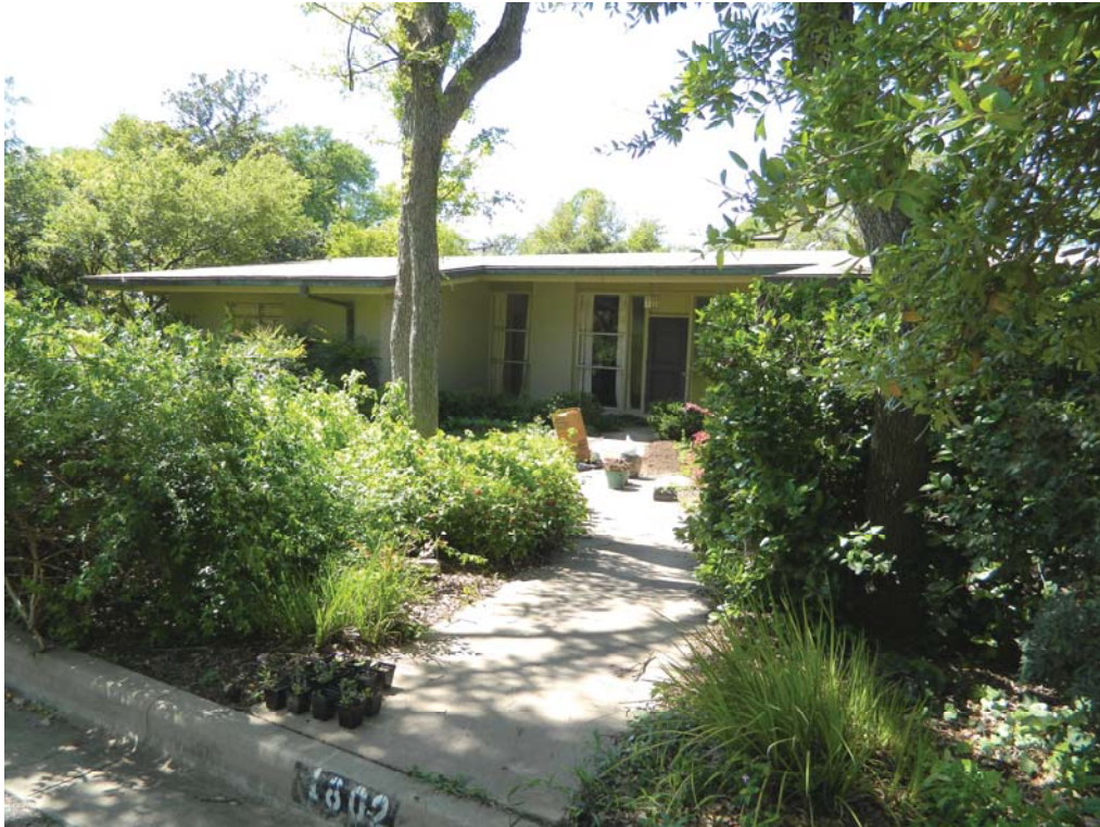
Garwood House, 1802 San Gabriel Street (1961)