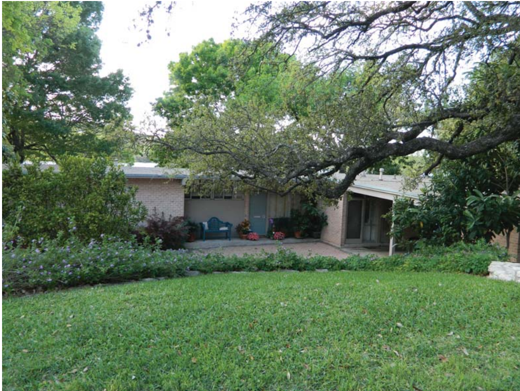
Ritter House, 2700 Scenic Drive (1955)