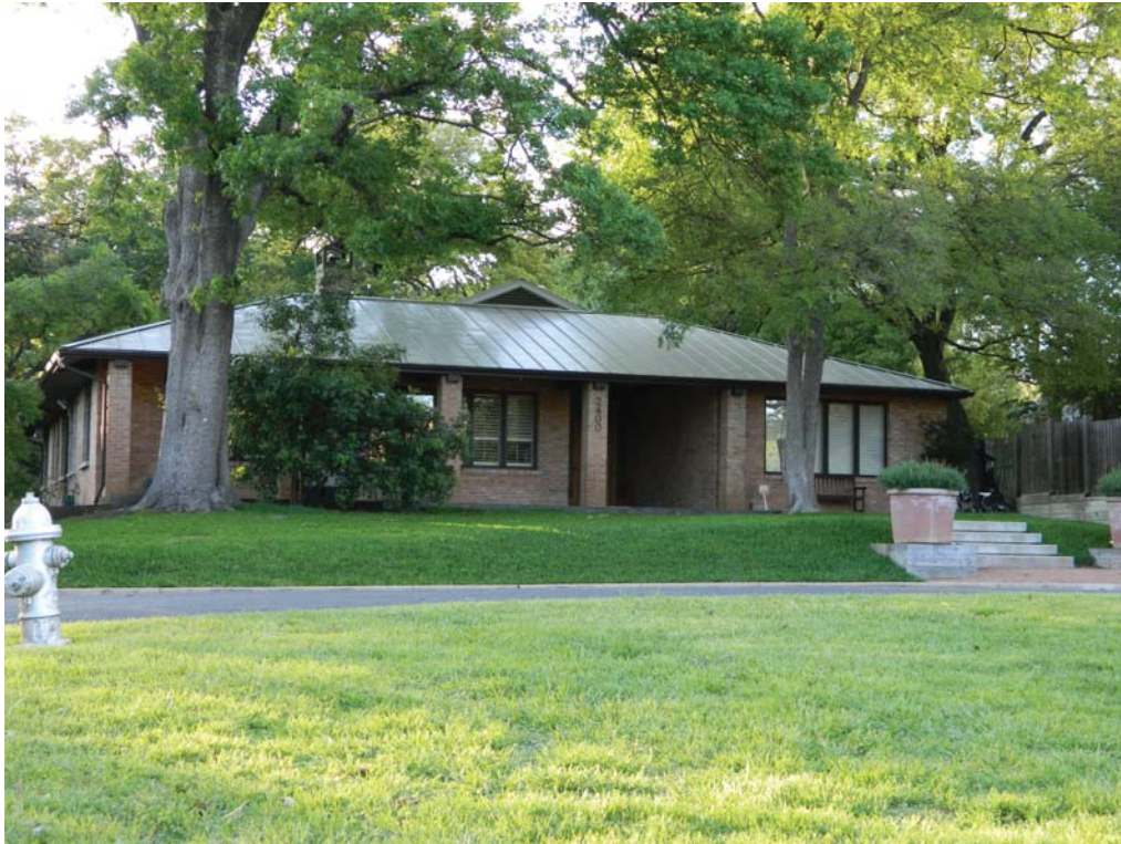
Hanna House, 2400 Pemberton Place (1949)