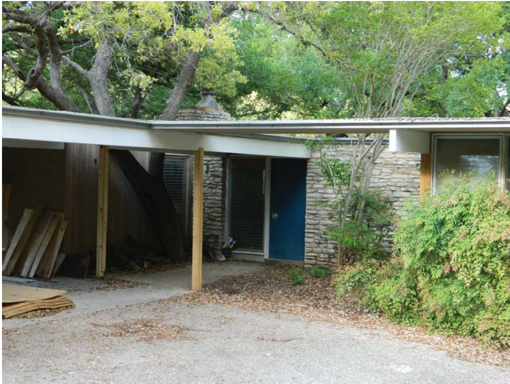
Kreisle House (front door), 2509 Schulle Avenue (1954)