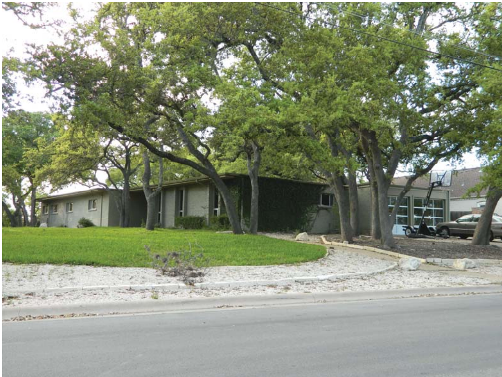
Gellman House, 5200 Ridge Oak Drive (1951)