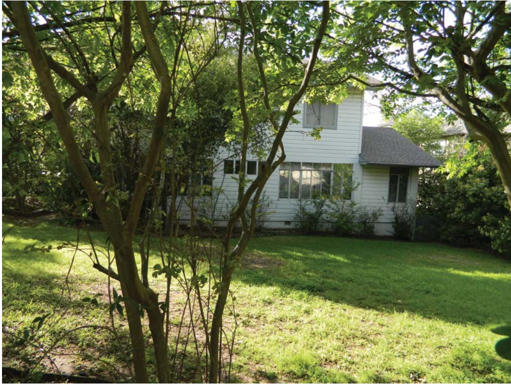
Cohn House, 2612 Spring Lane (1950)