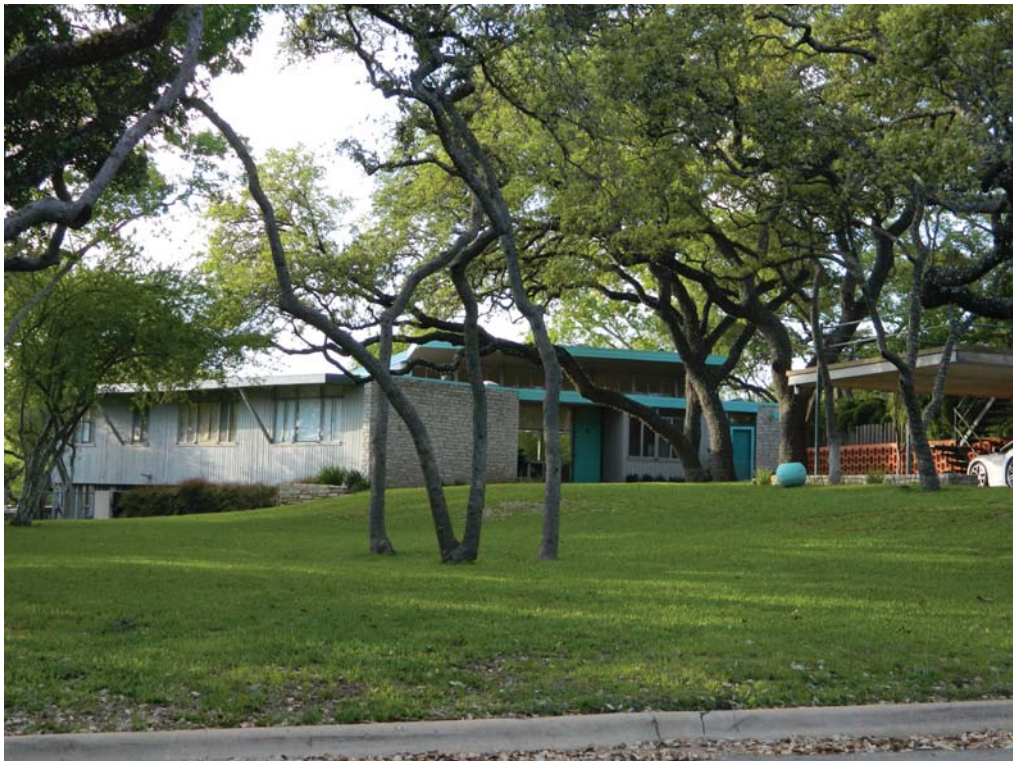
Arthur Fehr House, 5102 Ridge Oak Drive (1949)