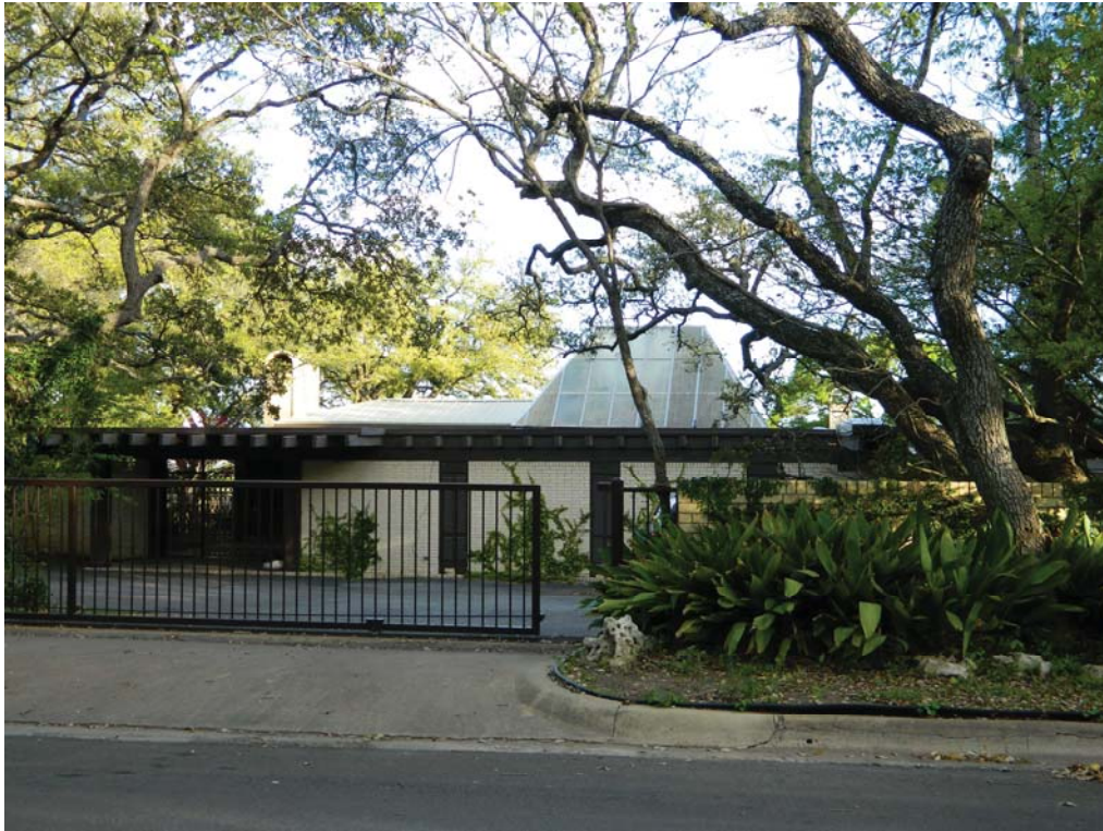
Hooten House, 4603 Ridge Oak Drive (1953)