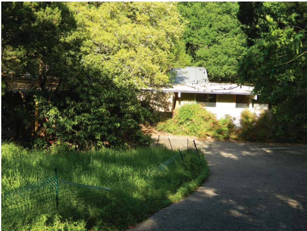
Kreisle House, 2509 Schulle Avenue (1954)