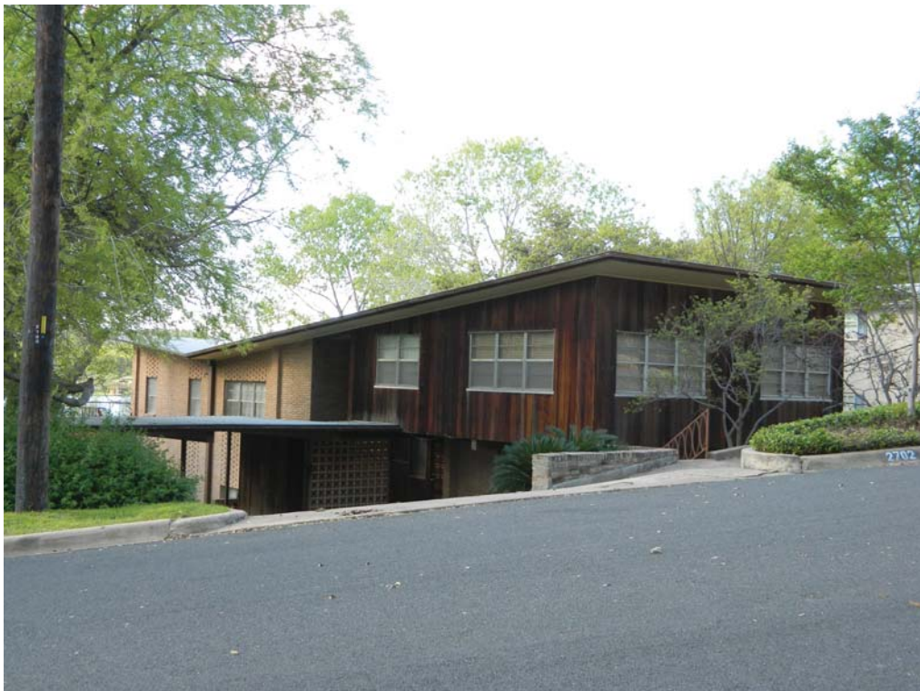
Mancaluso House, 2702 Scenic Drive (1955)