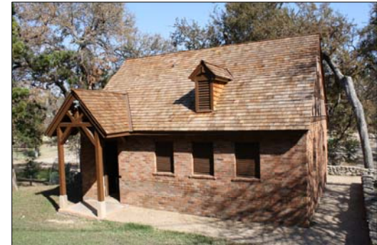
Pease Park Tudor Cottage