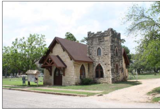
Oakwood Cemetery Chapel