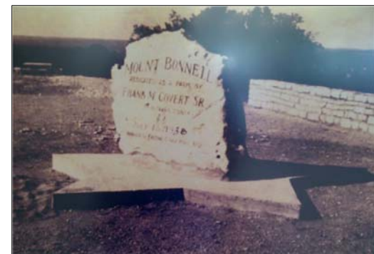
Mt. Bonnell at Covert Park