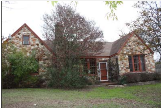
Zilker Park Caretaker Cottage