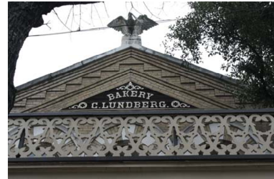
Lundberg Bakery (The Old Bakery)