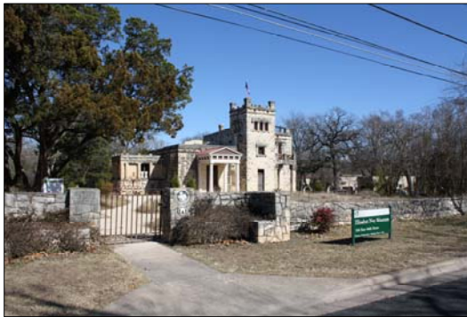
Elisabet Ney Museum (Formosa)