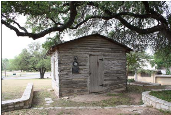
Henry G. Madison Log Cabin