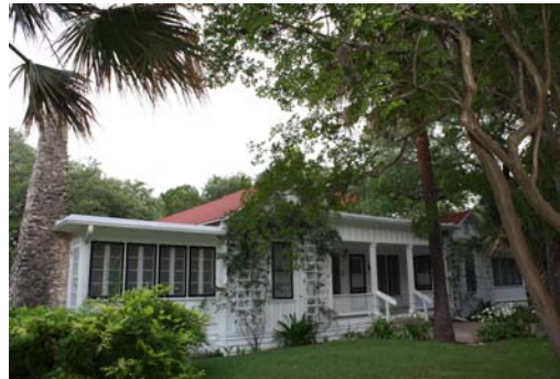
Mayfield-Gutsch House and Gardens