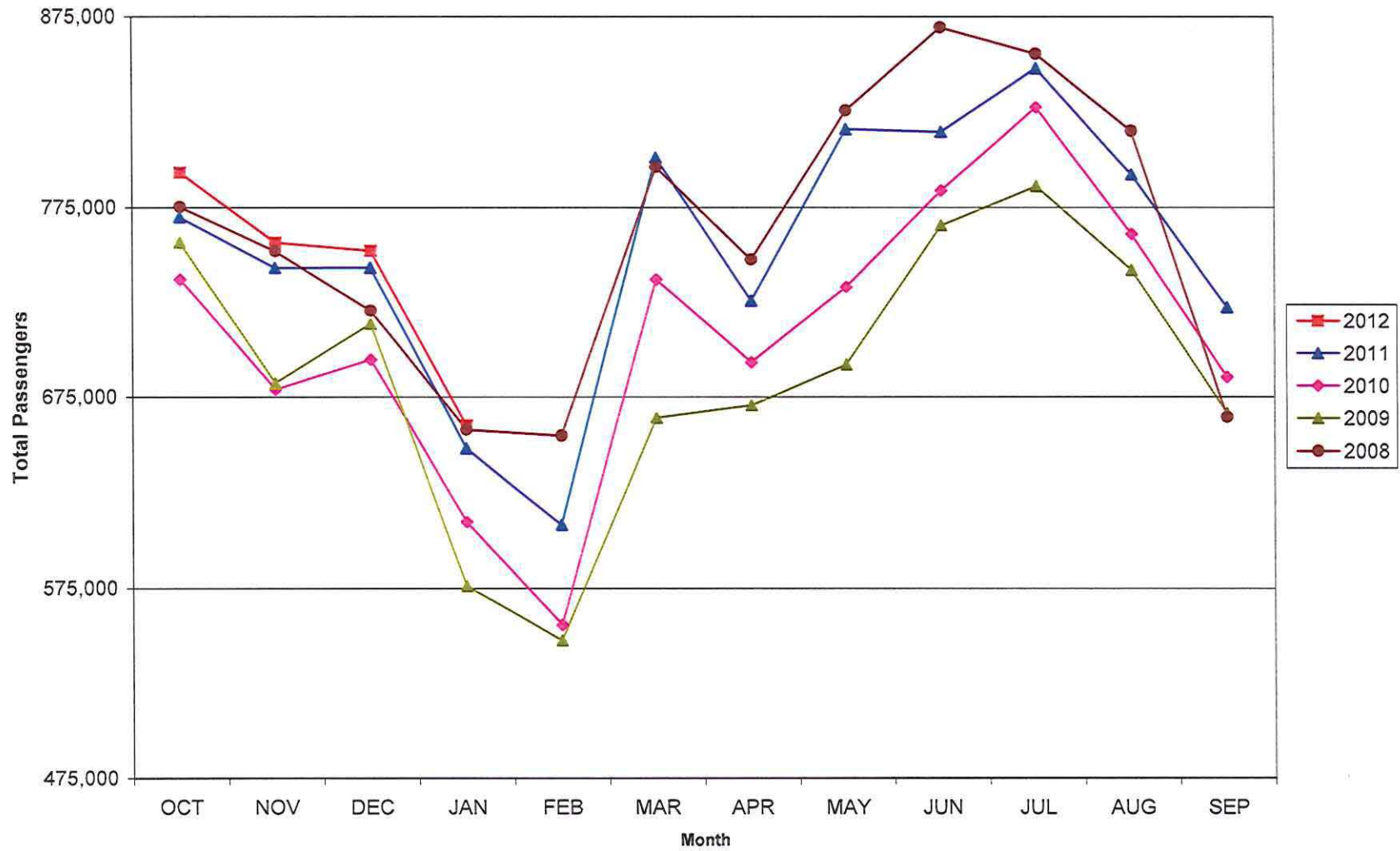
AUSTIN PASSENGER TRAFFIC Fiscal Year 2012 vs 2011