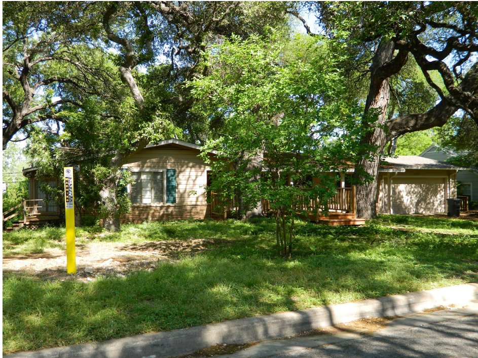
4804 Shoalwood Avenue ca. 1954