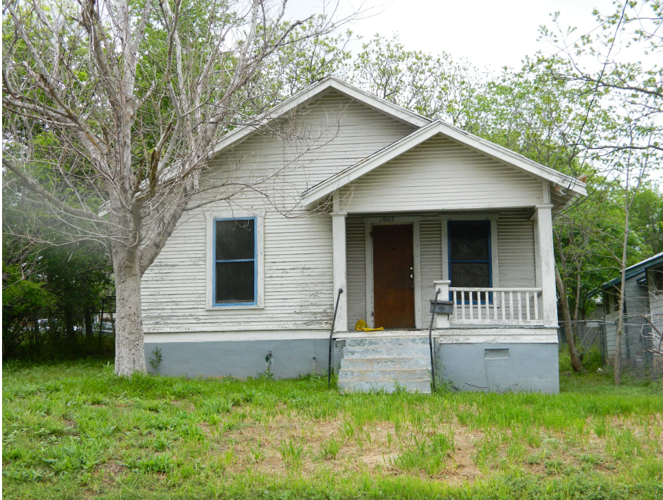
1902 E. 8 th Street ca. 1929