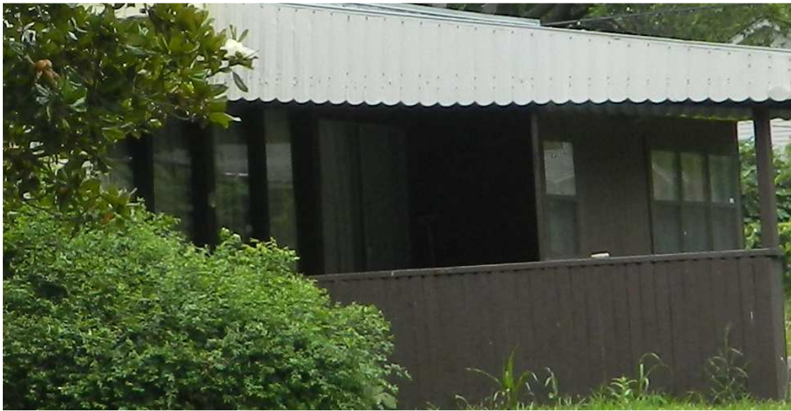
Detail of probable replacement windows on the south side of the house.

City Directory Research, Austin History Center By City Historic Preservation Office May, 2012