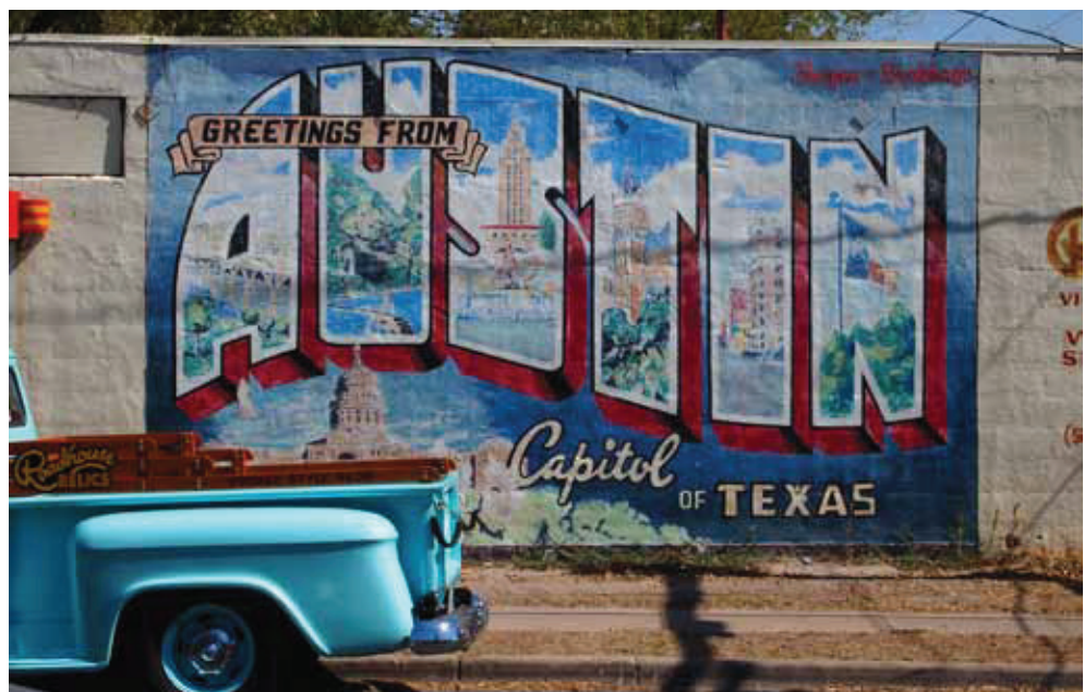
All images: courtesy of City of Austin, unless otherwise noted.

- Article X. Planning; Charter of the City of Austin, Texas