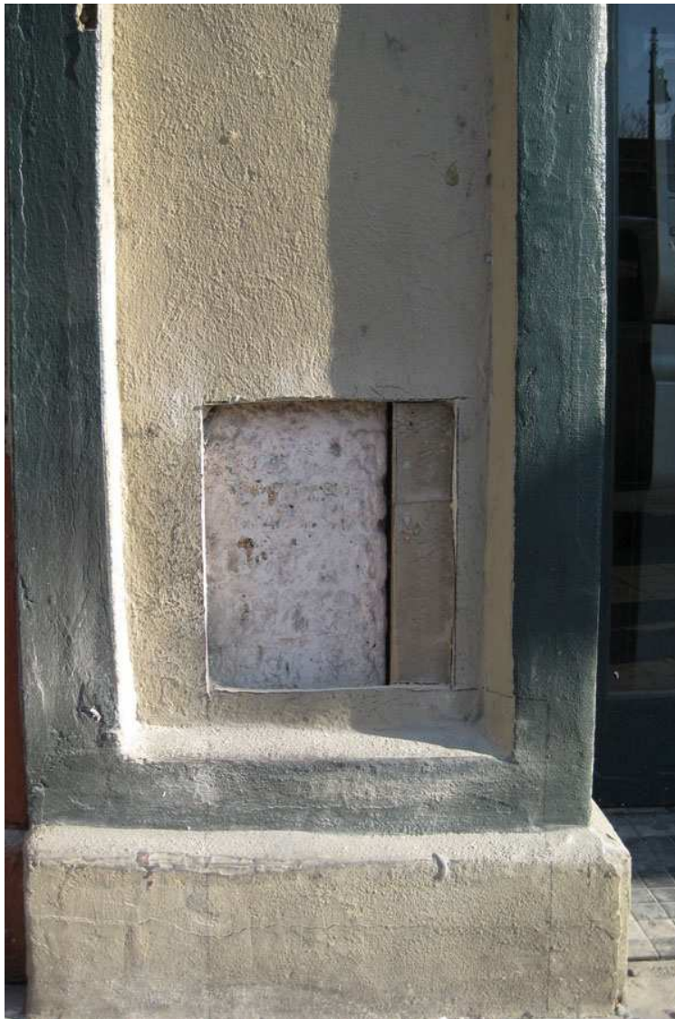
Exploratory demolition at the west pier of the building.