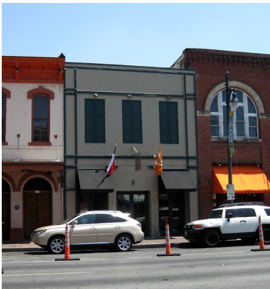
306 E. 6 th Street