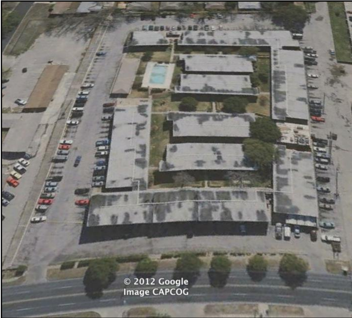
Sunnymeade Apartments at 501 E. Oltorf, April 2006, pre-demolition.