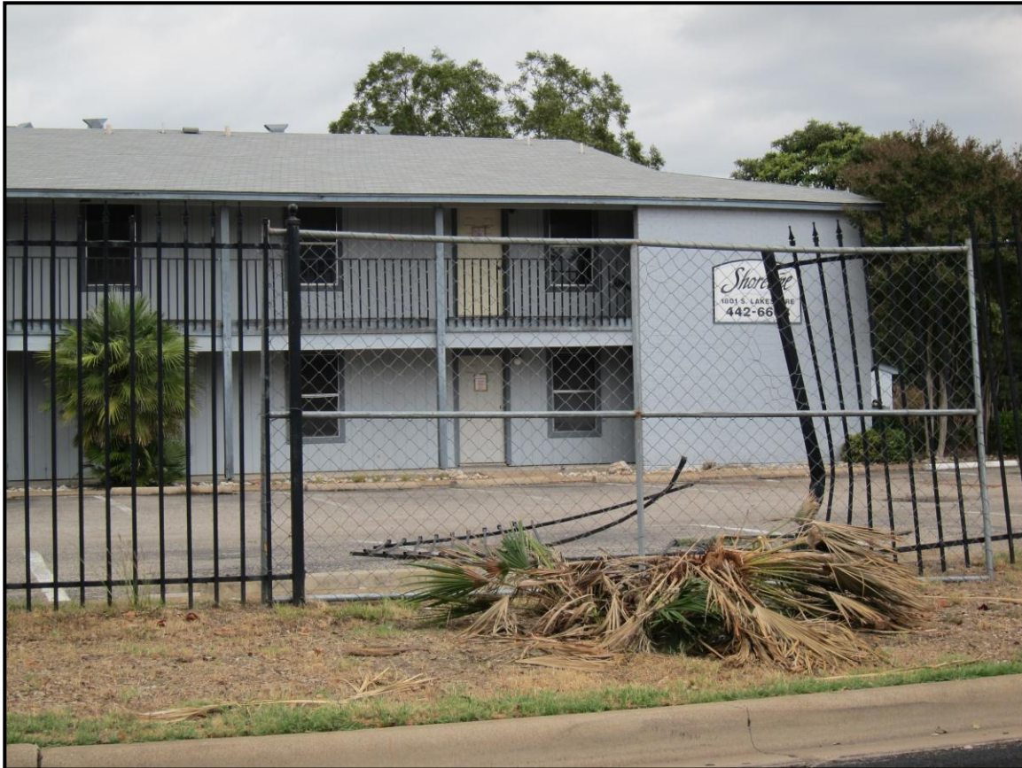
Shoreline Apartments in October 2011.

Summer Closing Date – The final move-out date for Shoreline tenants was during the summer. This allowed children at Shoreline to complete the school year at their current schools. Given the 100-plus Shoreline children attending Sanchez Elementary, the summer move-out date also helped the school by not forcing out such a large number of students in the middle of the school year.