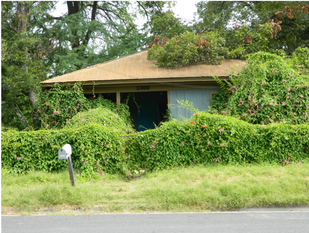
2300 Holly Street ca. 1917