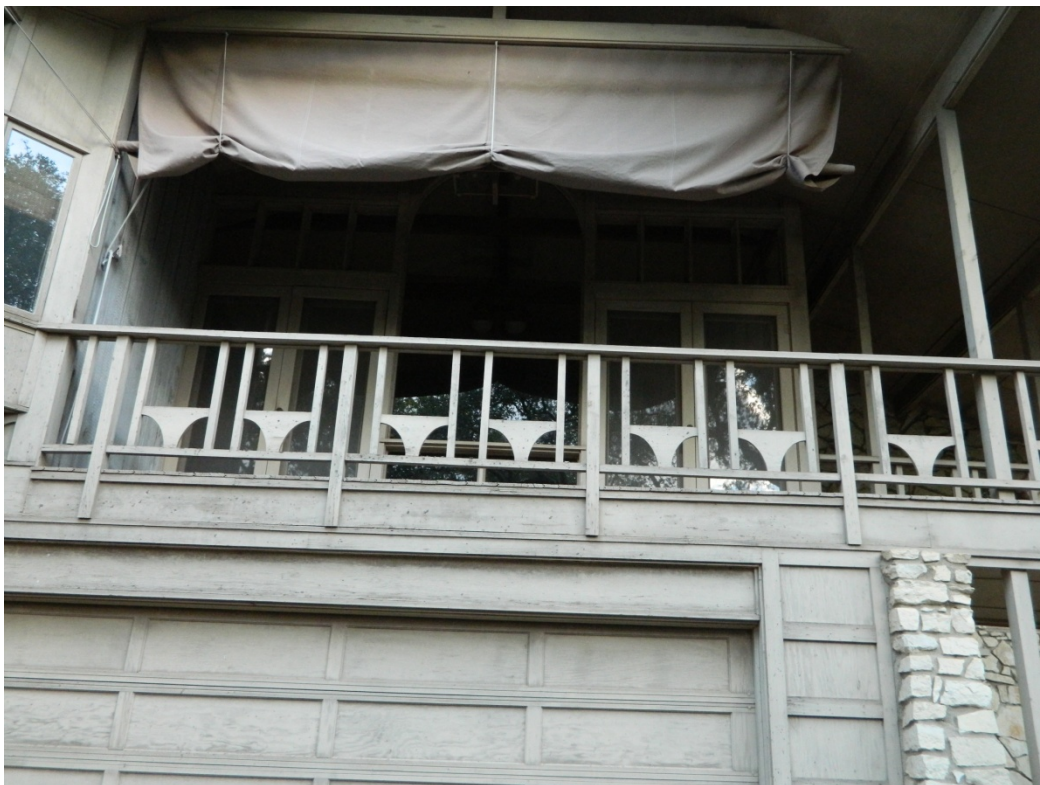
Detail of porch railing