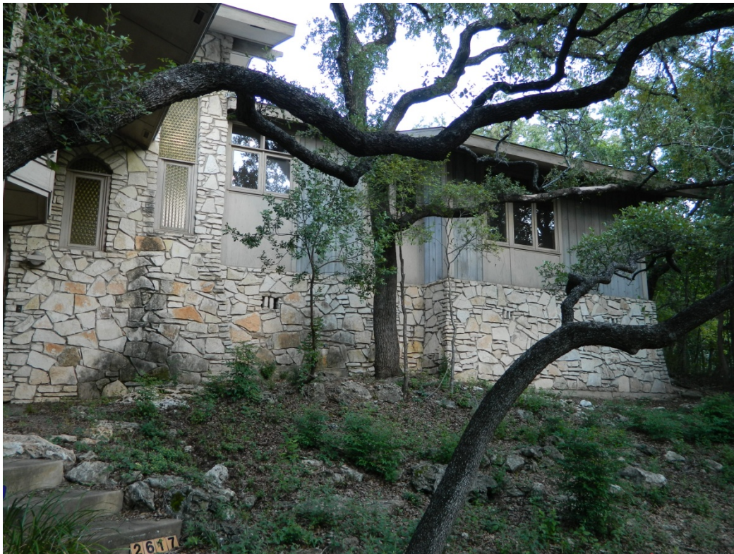
Detail of south wing