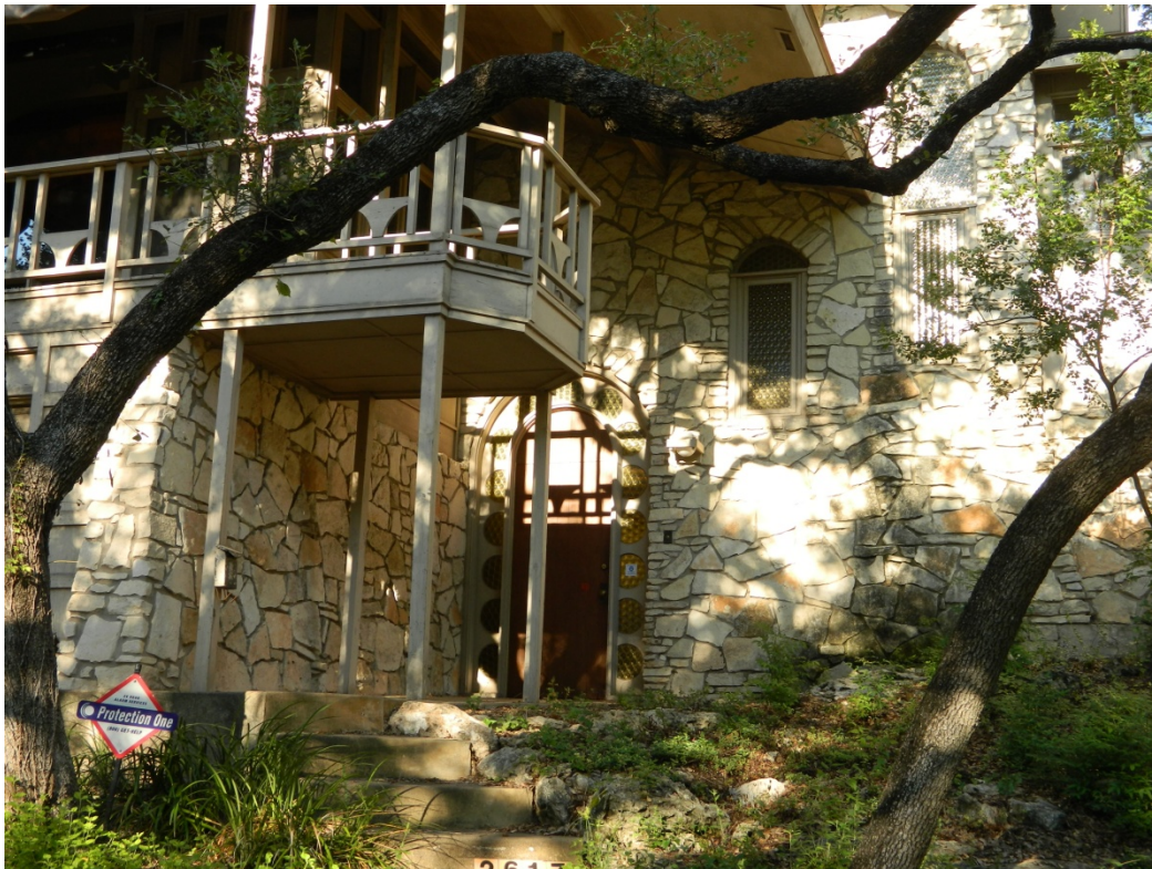
Detail of front entry and porch railing