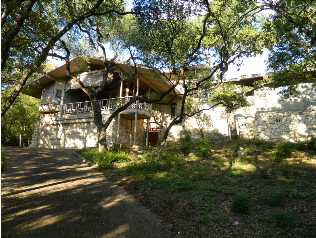
2617 Pecos Street ca. 1961