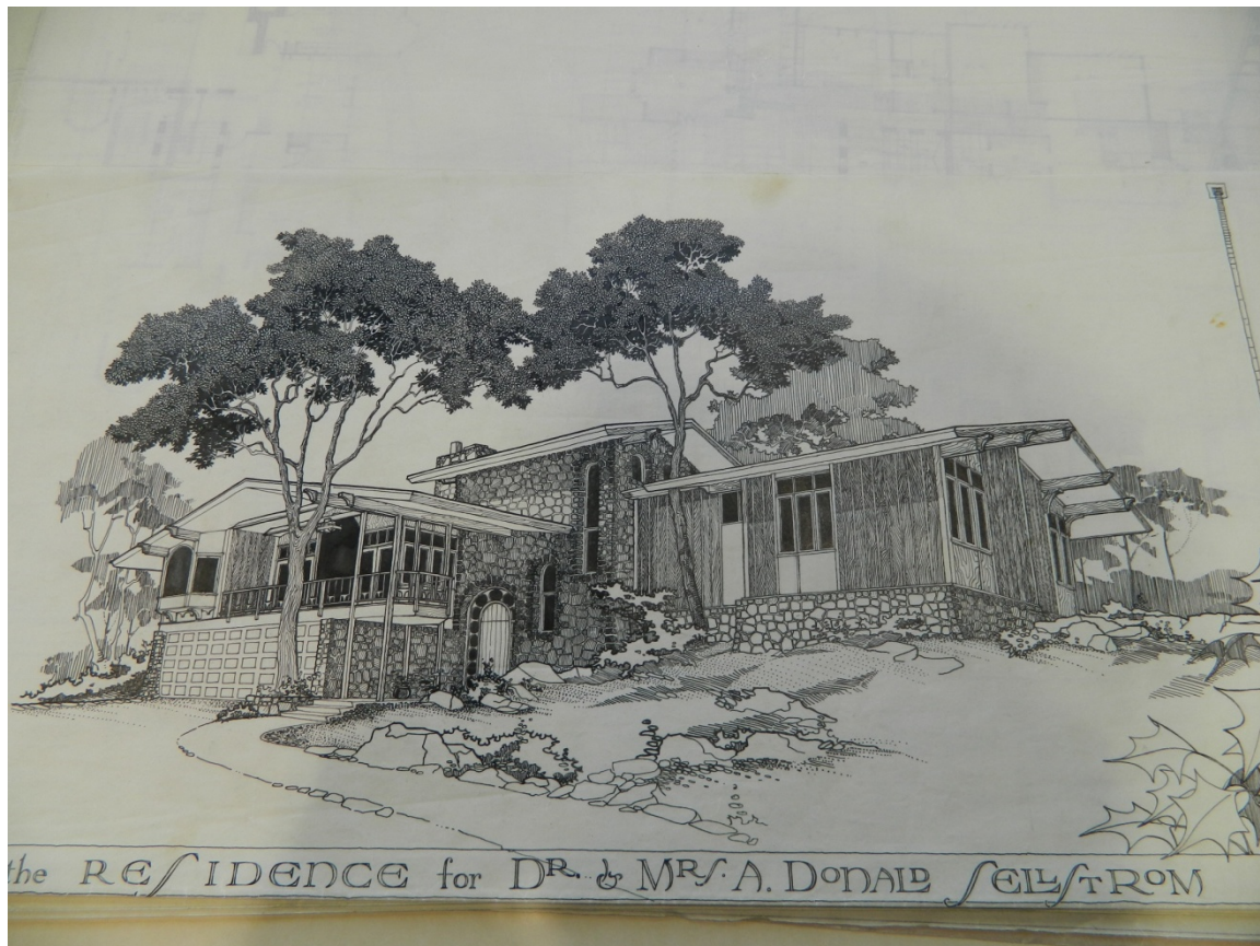
1961 rendering of the house by Leonard Lundgren of Lundgren & Maurer, Architects