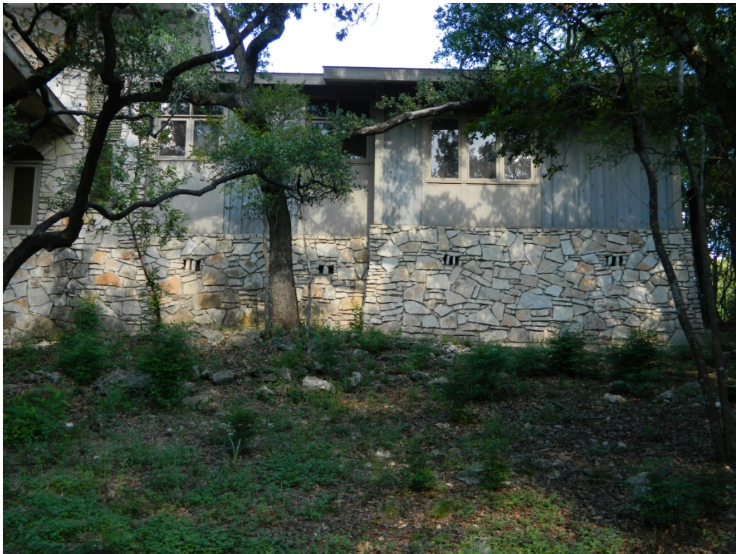
Detail of south wing