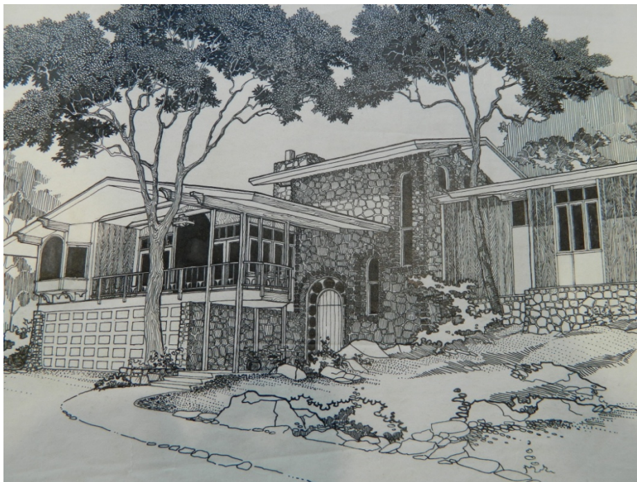
Detail of front section of the house showing the round-arched door and windows in the central entryway, the integral garage, and the porch above.