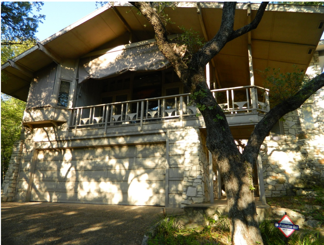
Detail of front entry, integral garage, and porch railing