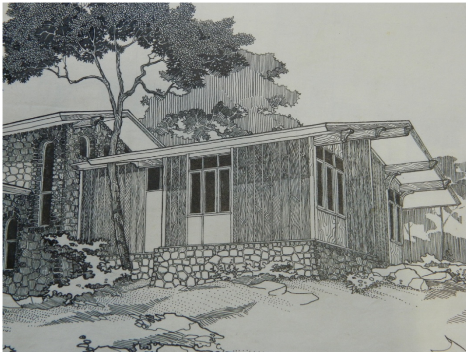
Detail of south wing