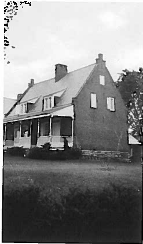
Pieter Bronck House in Cossackie, New York (1662, expanded in 1738)