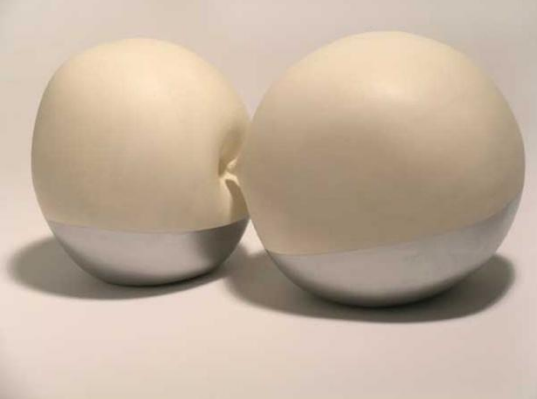
Sharon Engelstein Portfolio Images