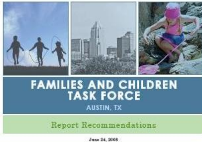
Families and Children's Task Force Report - June 2008