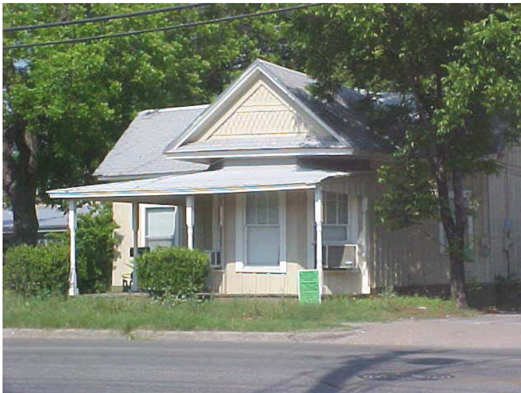
The house when it was located at 1502 S. 1 st Street (2007)