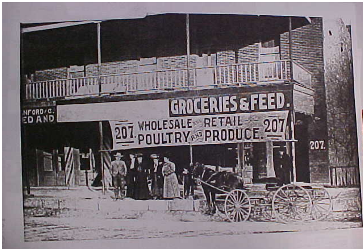
The Cabaniss Grocery Store, 207 Congress Avenue (ca. 1908).