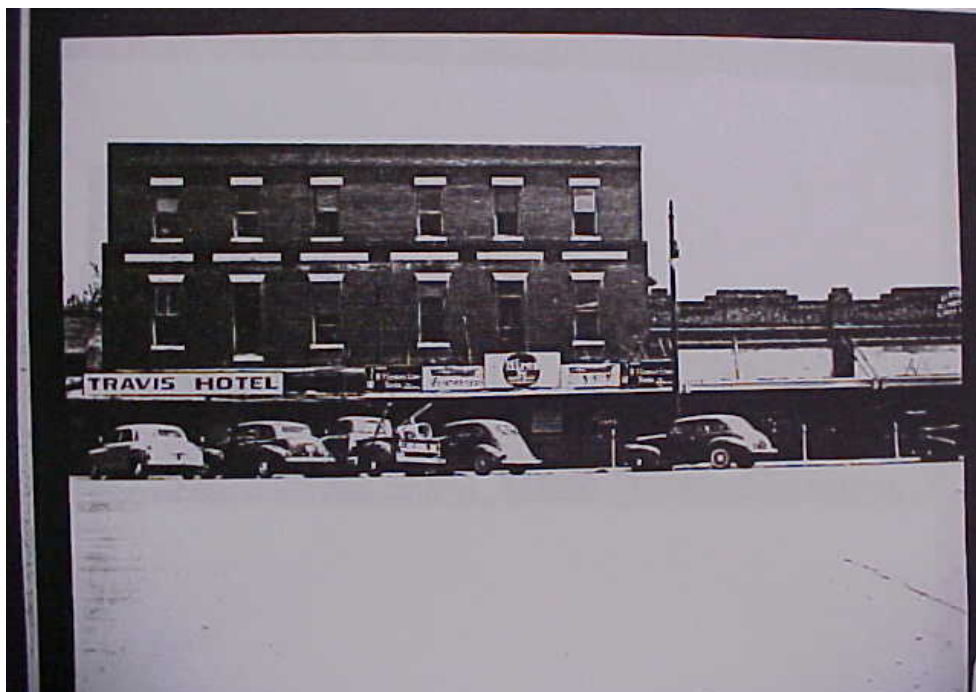
A ca. 1939 photograph of the building which previously housed the Cabaniss House Hotel and Scott Cabaniss' grocery store. The third story was added when the building became the Travis Hotel.