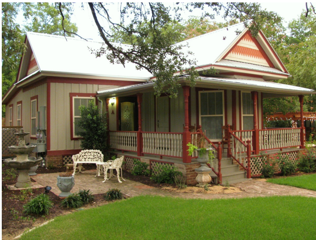
The house as it appears today (2012)

The porch posts are original; the porch railings are new; the house has been painted in period-appropriate colors, a new roof and porch roof has been added, and new screens have been manufactured to match the originals.