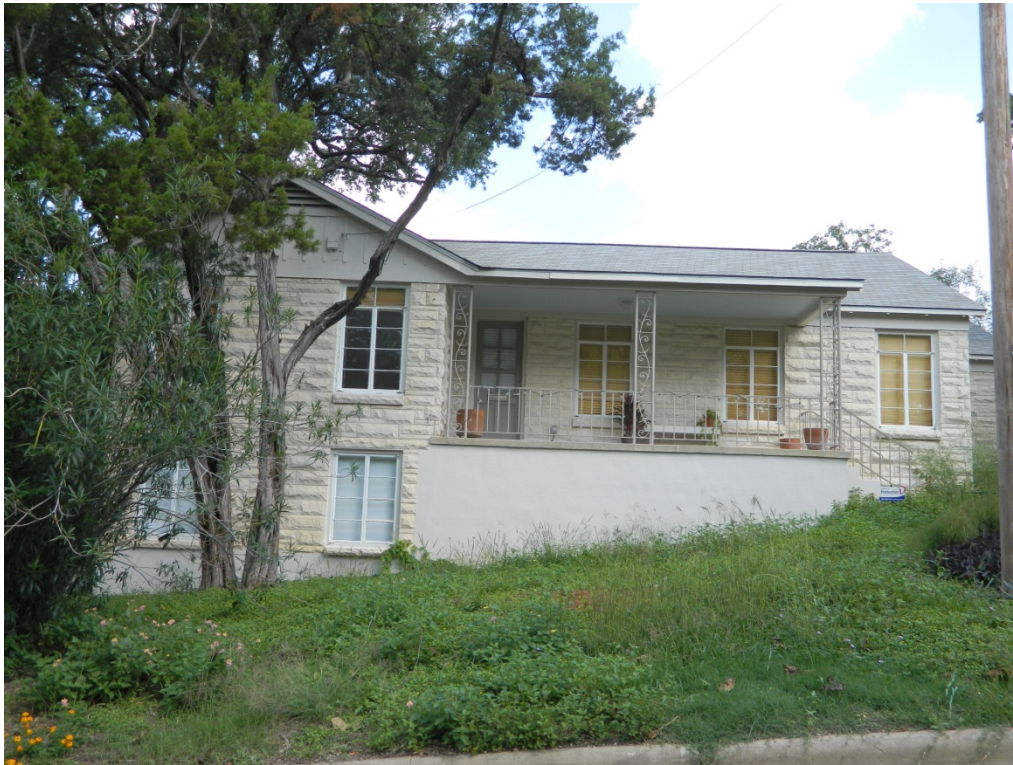
1512 Alta Vista Avenue ca. 1951