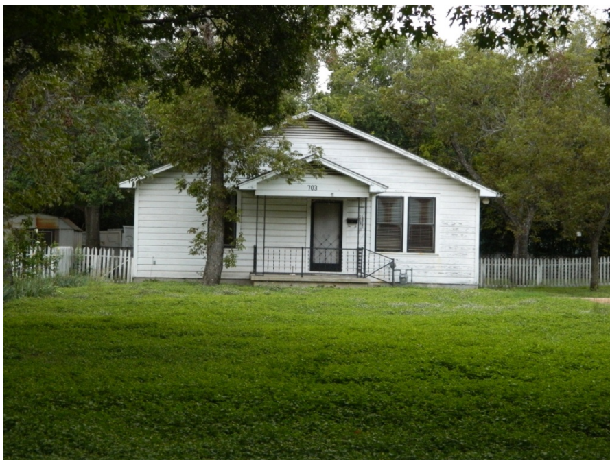
703 E. 49 th Street ca. 1948