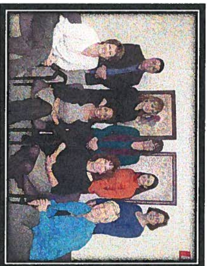
(Standing left to right)

The social and case workers are also available to assist private court appointed attorneys. Referrals are made for a variety of social services. Follow-up case management services are also provided.