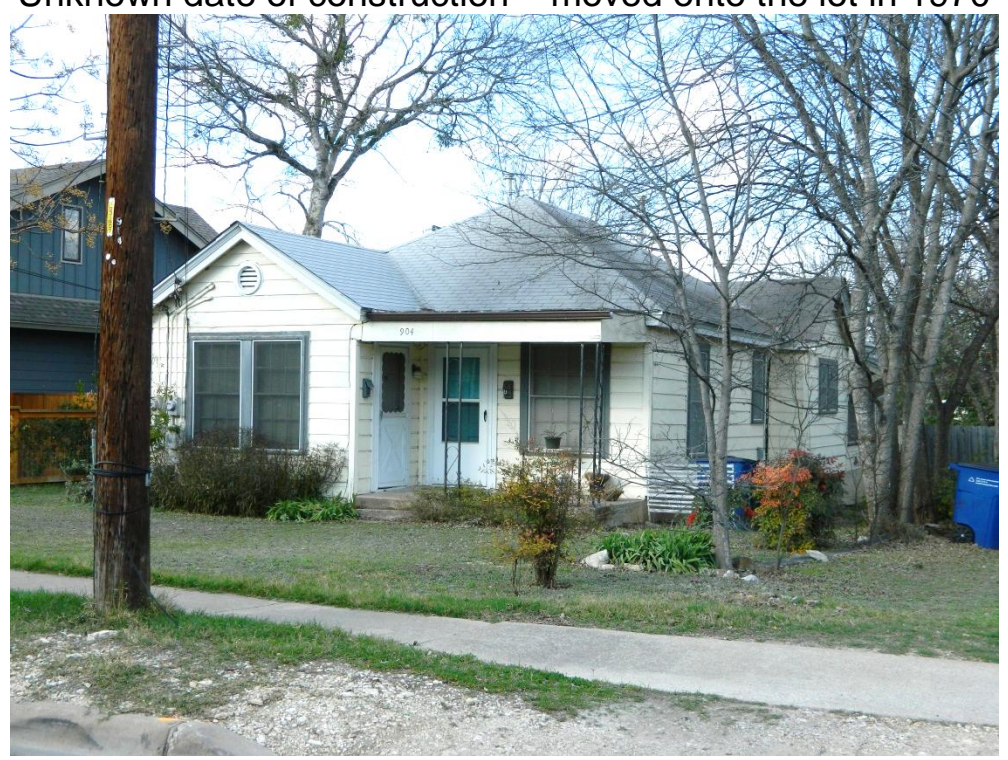
904 West Johanna Street Unknown date of construction – moved onto the lot in 1970