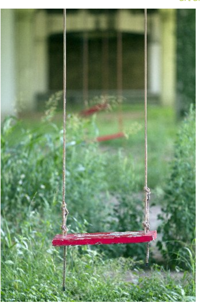
"Red Swing Project"