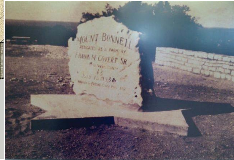
Original photo of historic monument