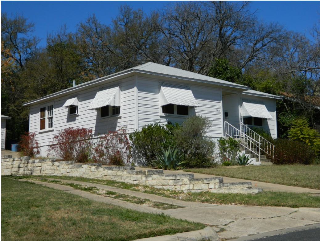
1904 Bremen Street ca. 1951