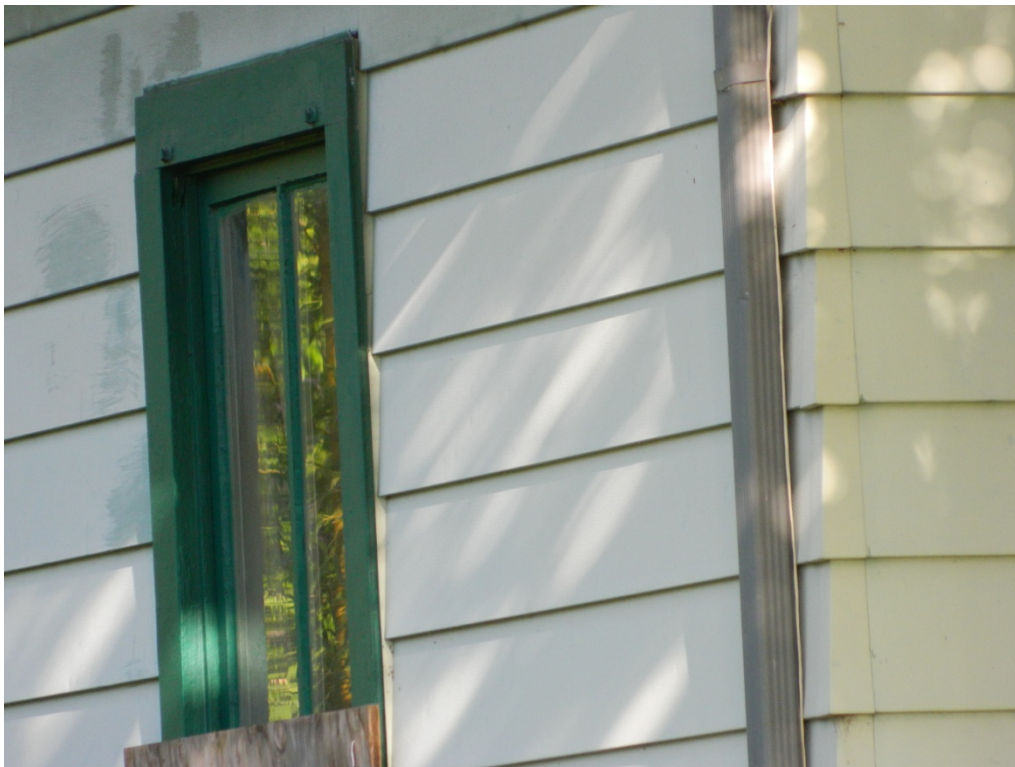
Detail of north window showing the 2:2 configuration