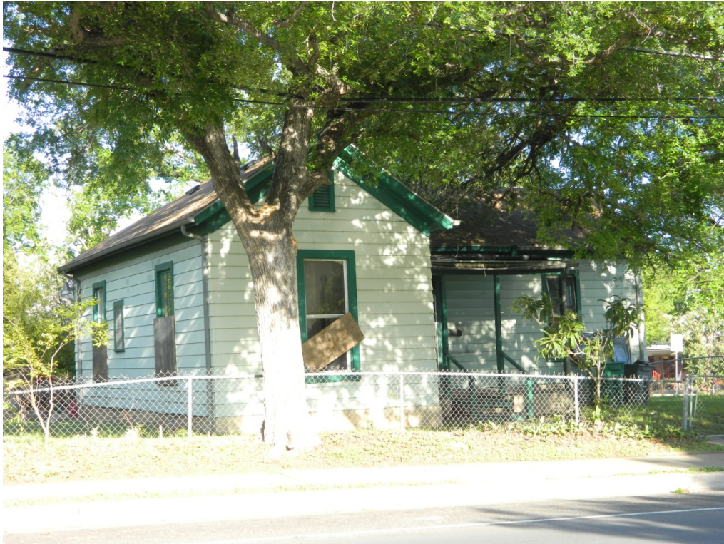
1701 Chicon Street ca. 1908