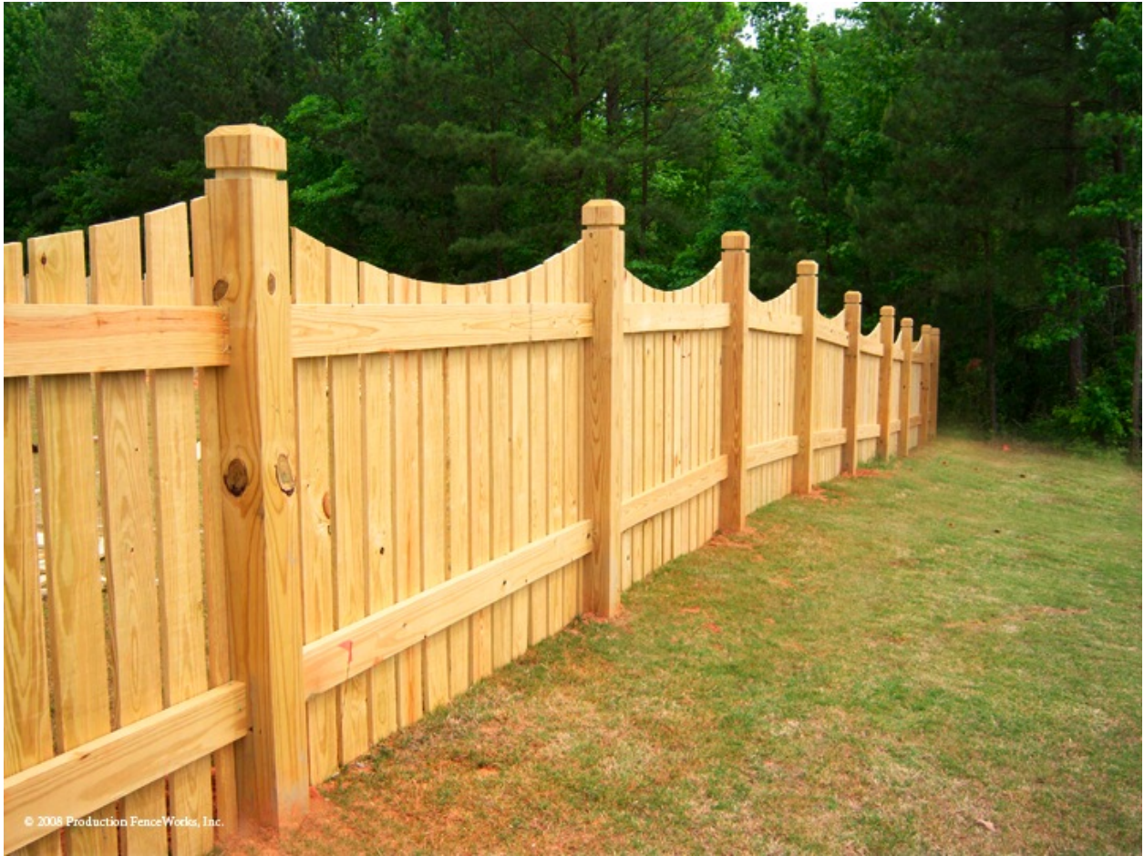
Detail of proposed back yard fence