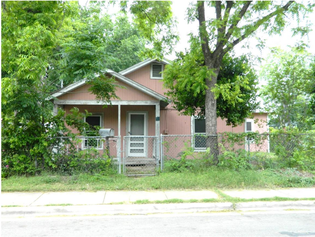
1310 Garden Street and 70 Navasota Street ca. 1929