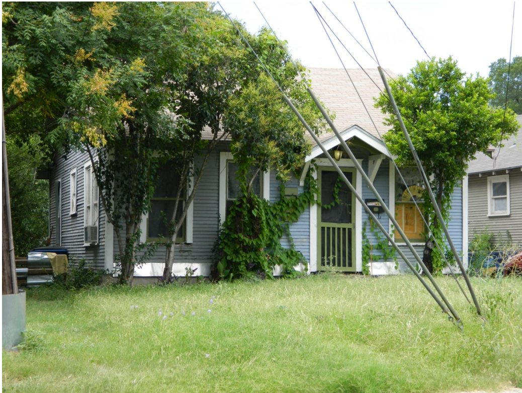
814 San Marcos Street ca. 1935