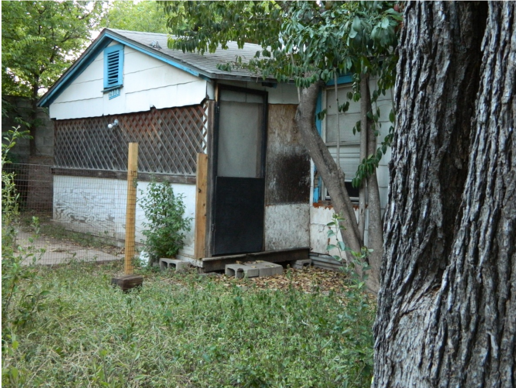
2414 E. 9 th Street ca. 1936