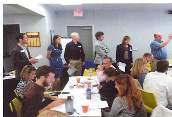
Attendees at the full-day workshop