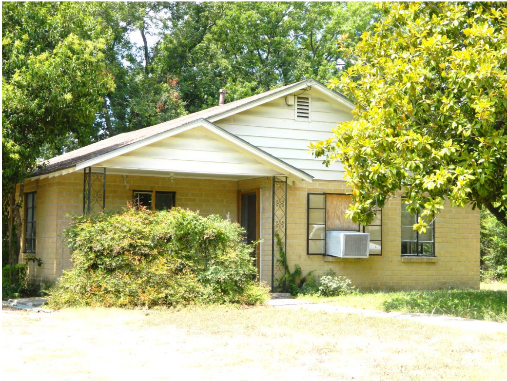
8502 Bowling Green Drive ca. 1949