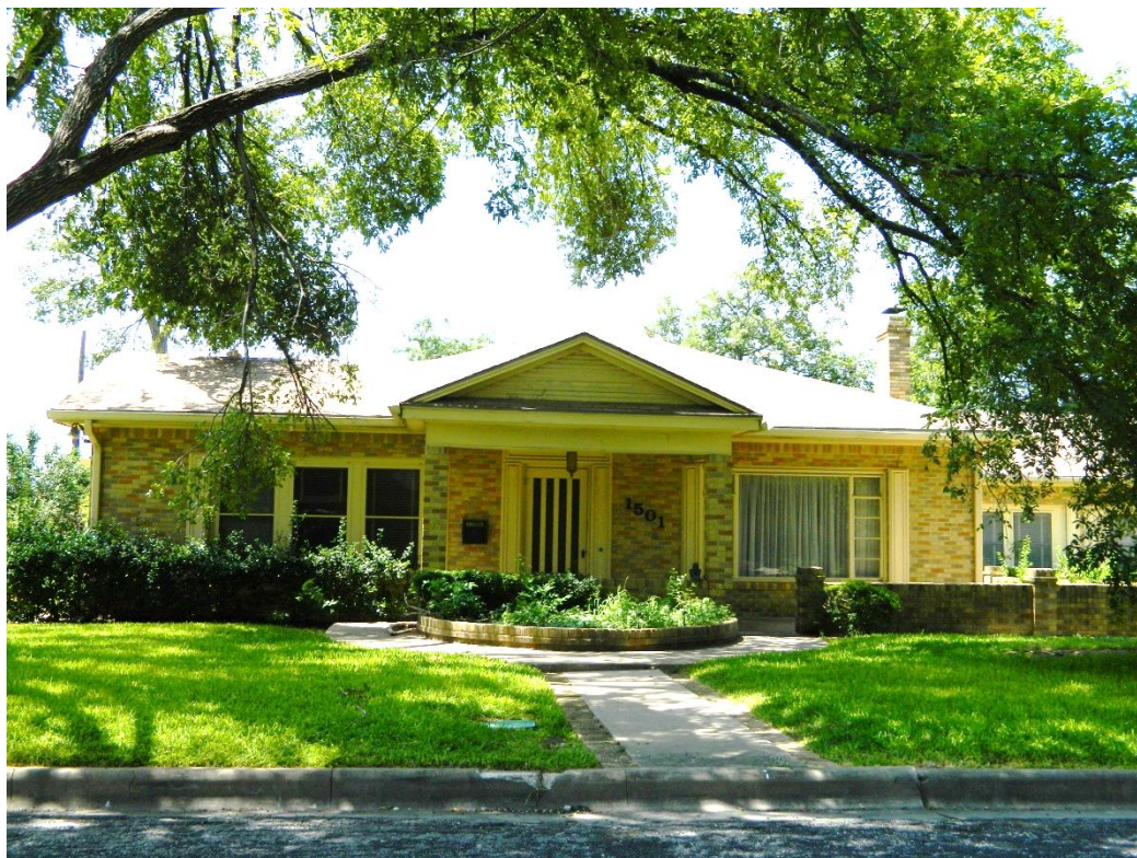
1501 Richcreek Road ca. 1951