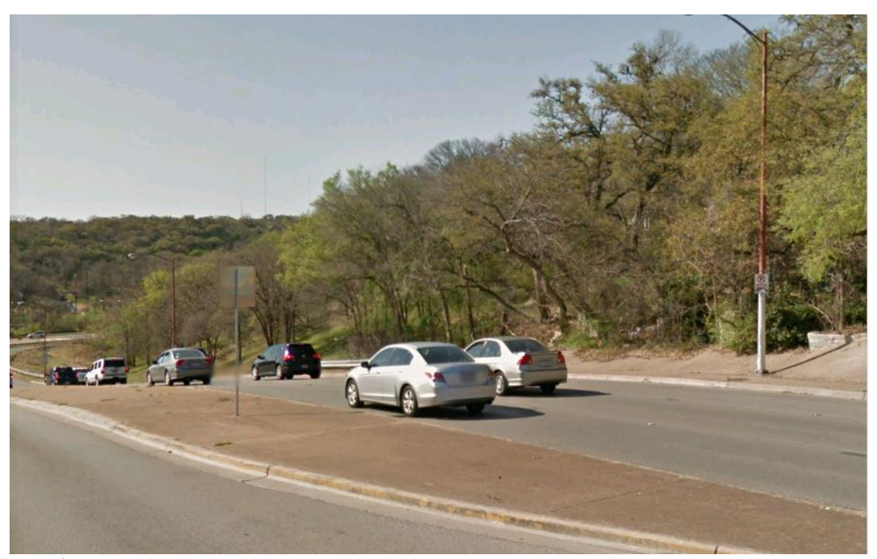
W. 15<sup>th</sup> Street looking east