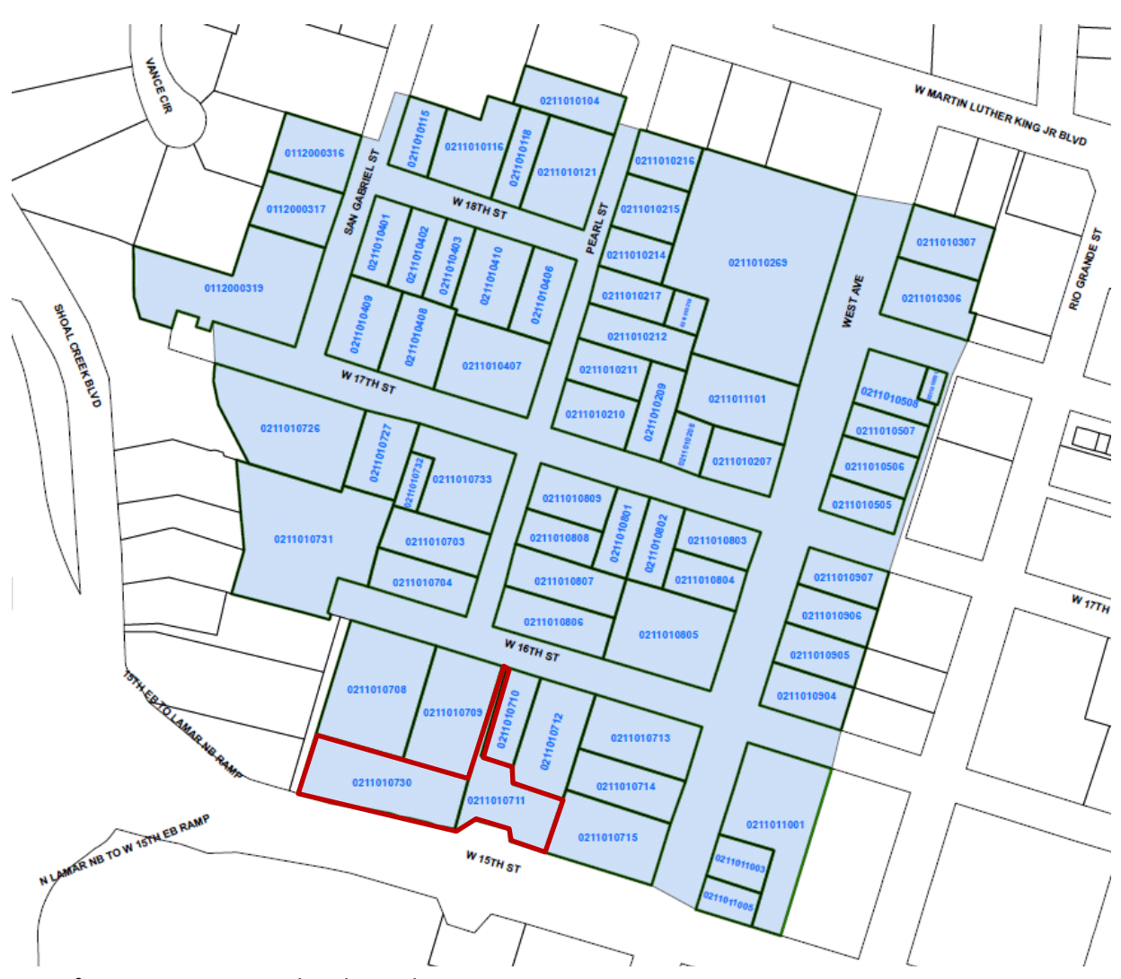
City of Austin property outlined in red.

City of Austin property located in boundaries of the proposed Old Judges Hill Local Historic District