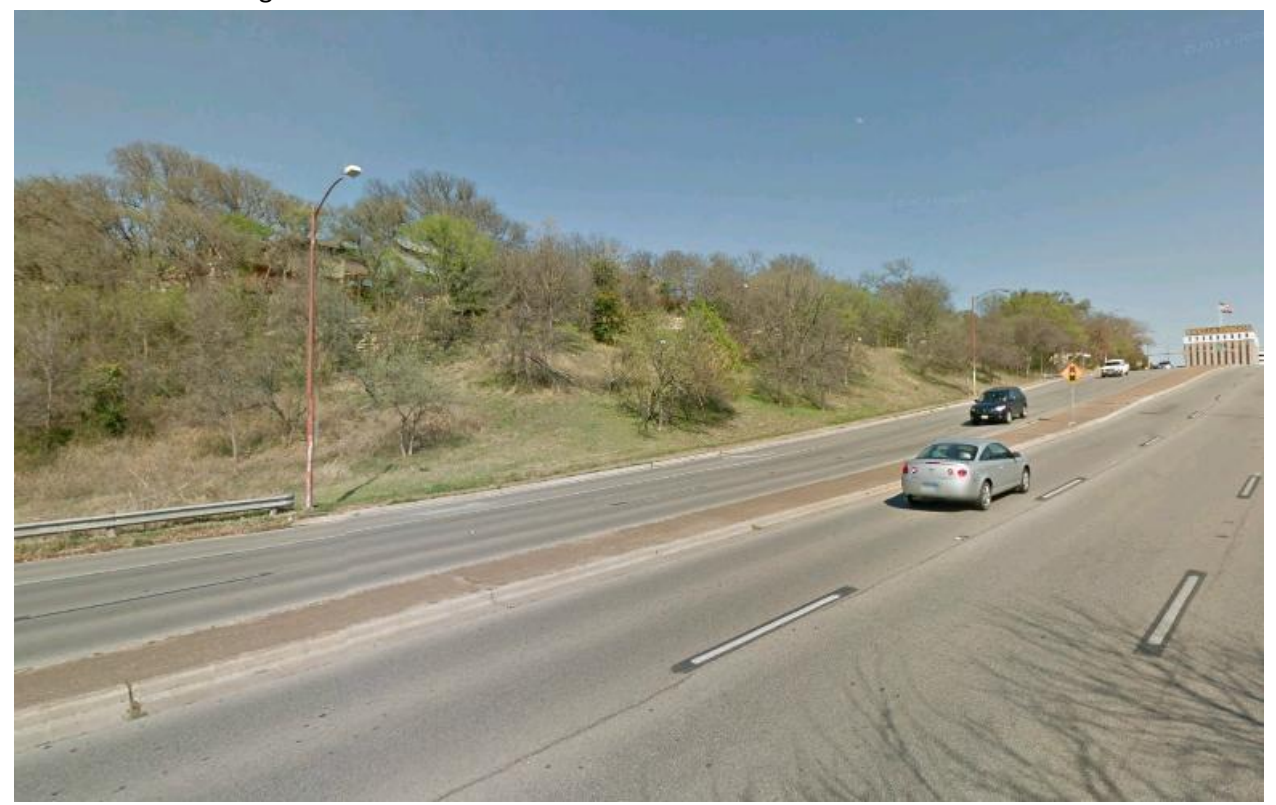
W. 15<sup>th</sup> Street looking west