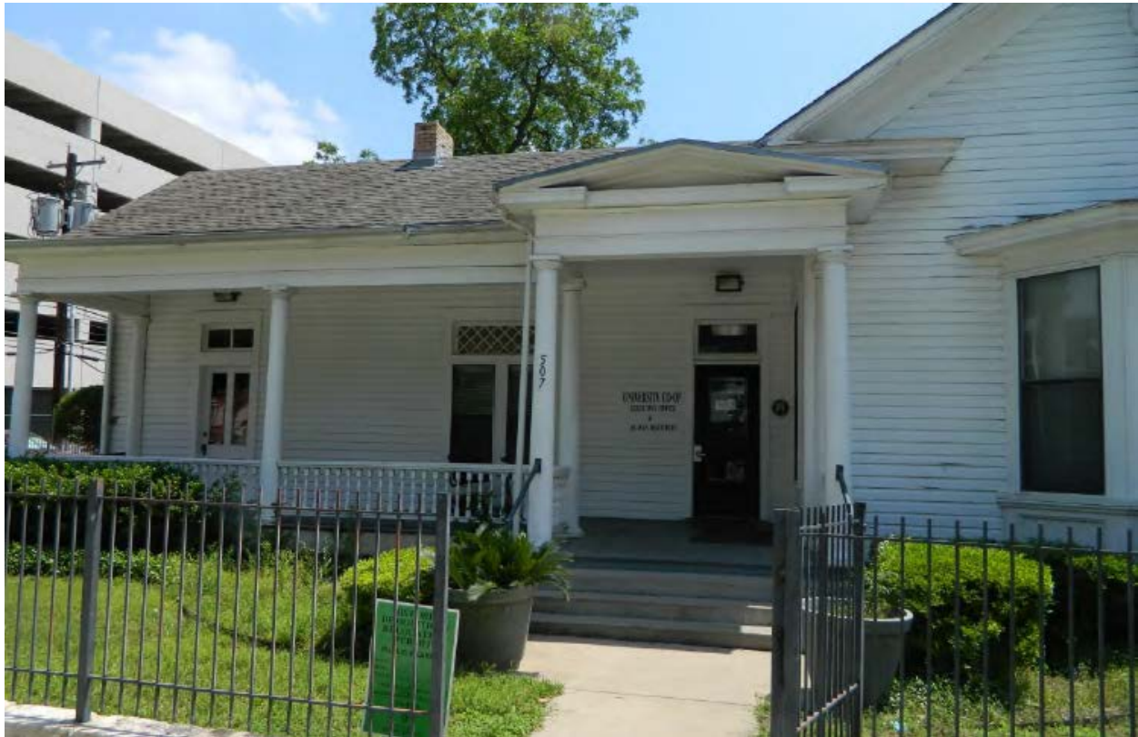
The house is proposed to be 12 feet closer to the front fence.