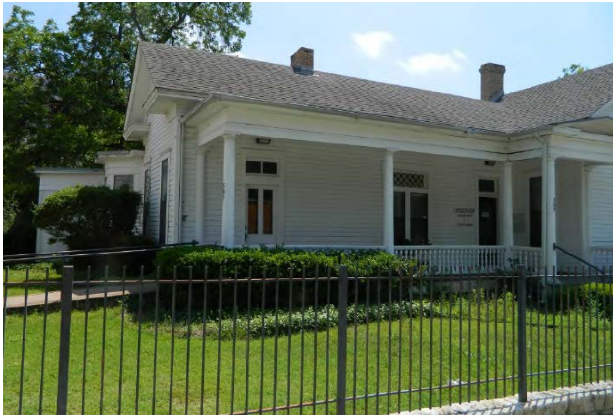
View of the front yard – the house will move 12 feet closer to the fence.