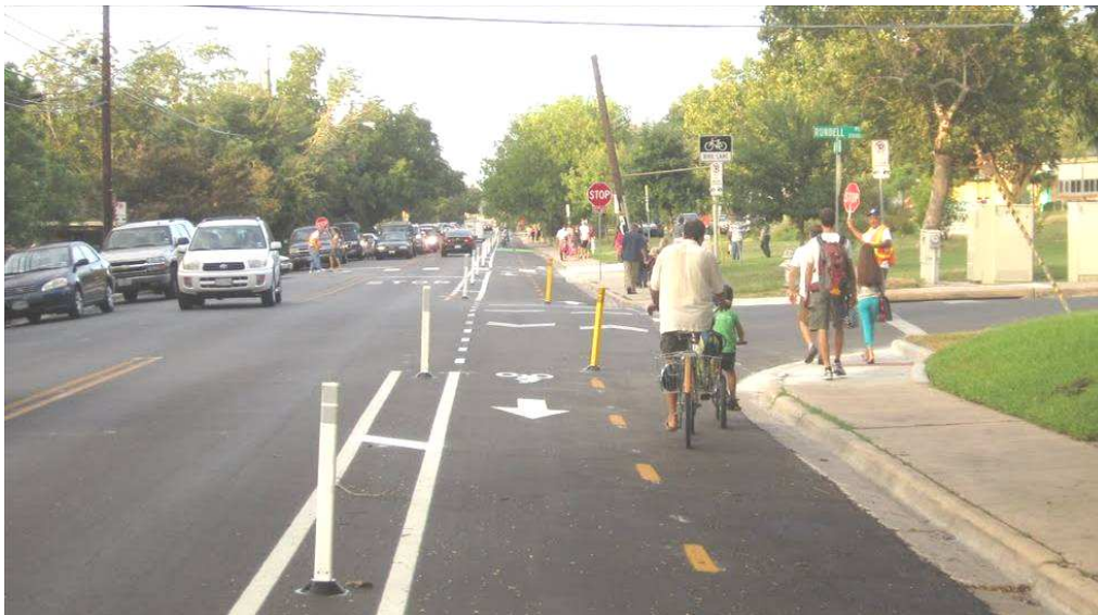
Figure 1 - Example of Cycle Tracks on Bluebonnet Lane at Zilker Elementary

Potential improvements under consideration are physically protected cycle tracks, off-street trails, and crossing improvements at Burnet Lane. In addition to proposed bicycle facilities, sidewalks and improved drop-off areas are being considered to improve access to school and facilitate convenient drop-off and pick-up.