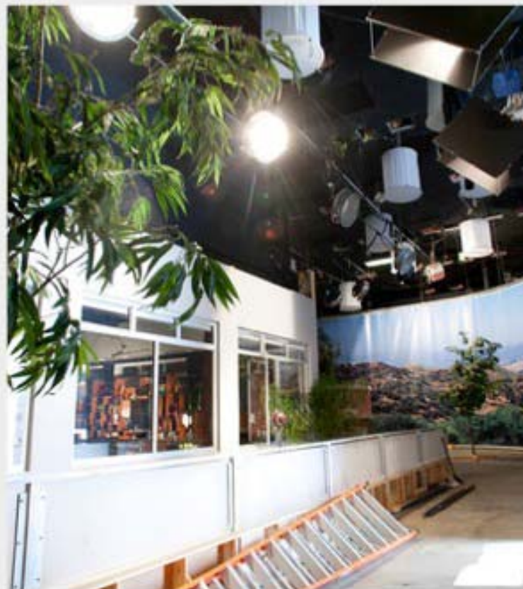
After remodel with television show in residence