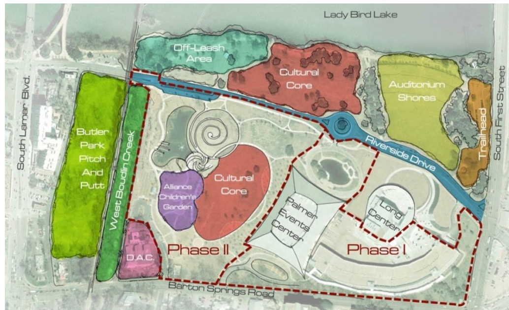
2011 Master Plan Concept Sketch