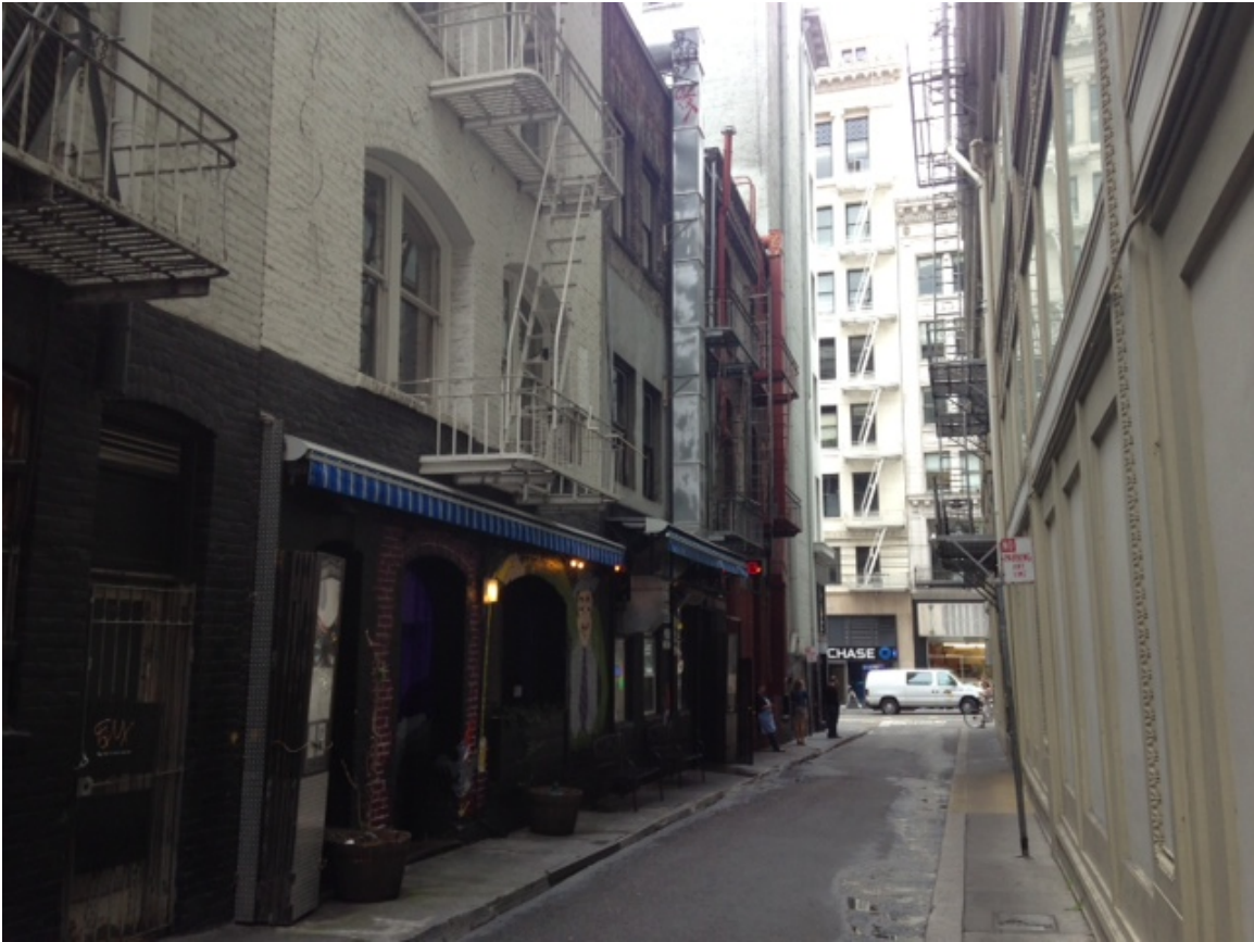
Seville, Spain Alley.

engaging lighting. Others may need more extensive improvement to allow for both utilitarian and social uses.