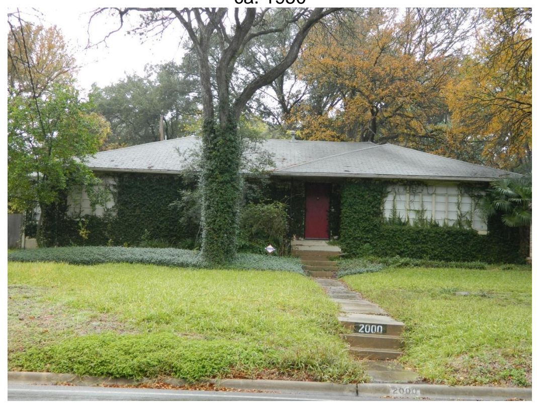
2000 Exposition Boulevard ca. 1950