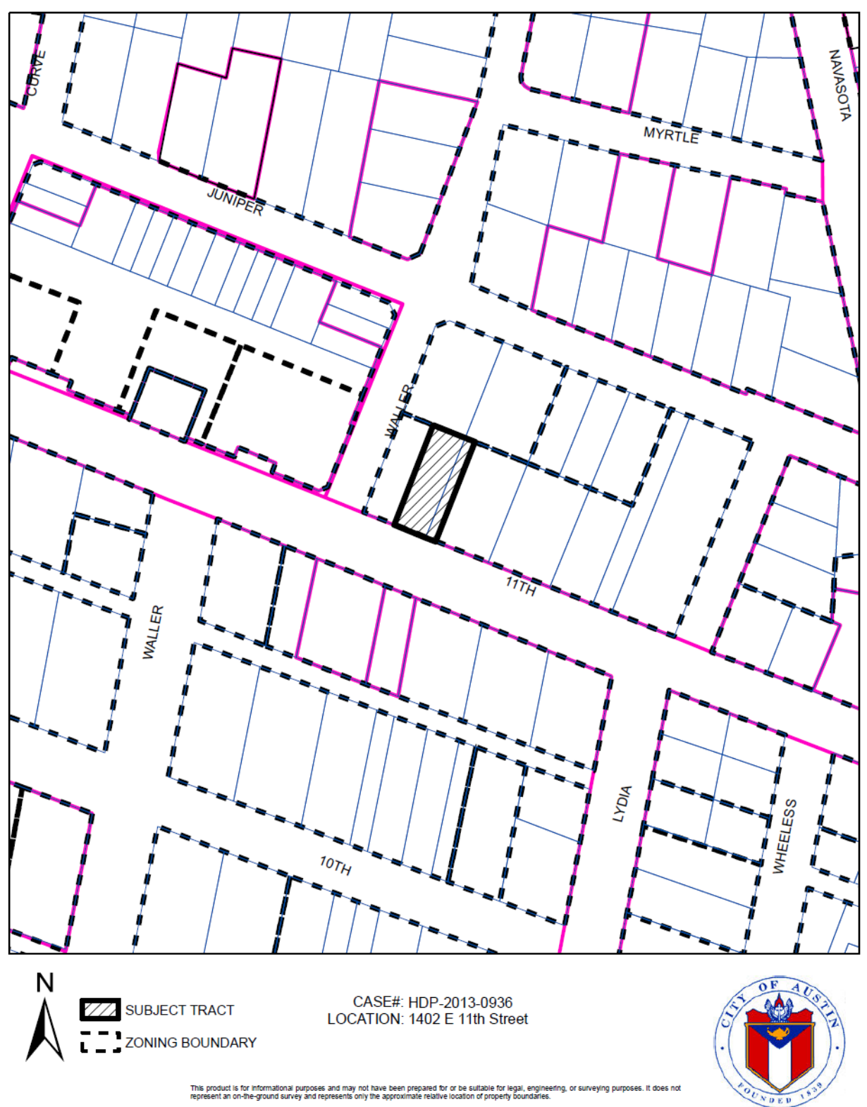
represent an on-the-ground survey and represents only the approximate relative location of property boundaries. This product has been produced by the Planning and Development Review Department for the sole purpose of geographic reference. No warranty is made by the City of Austin regarding specific accuracy or completences.