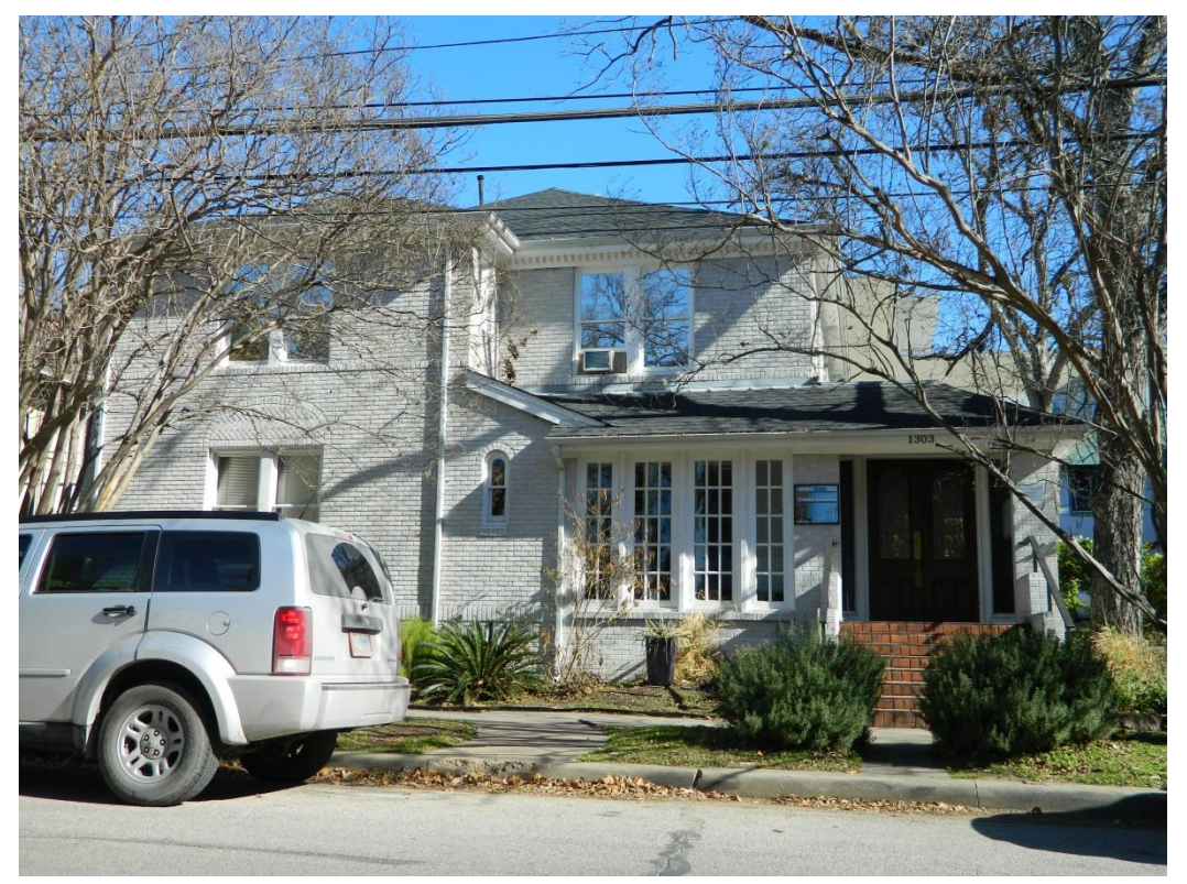
OCCUPANCY HISTORY 1303 San Antonio Street