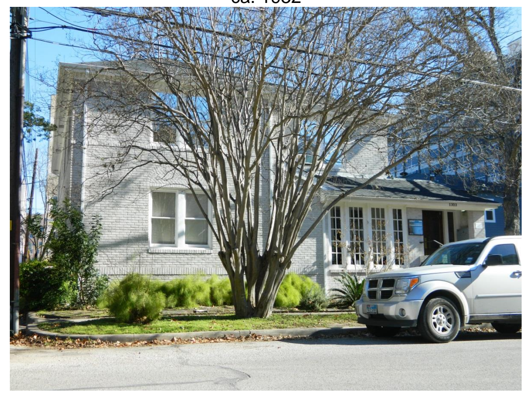
1303 San Antonio Street ca. 1932