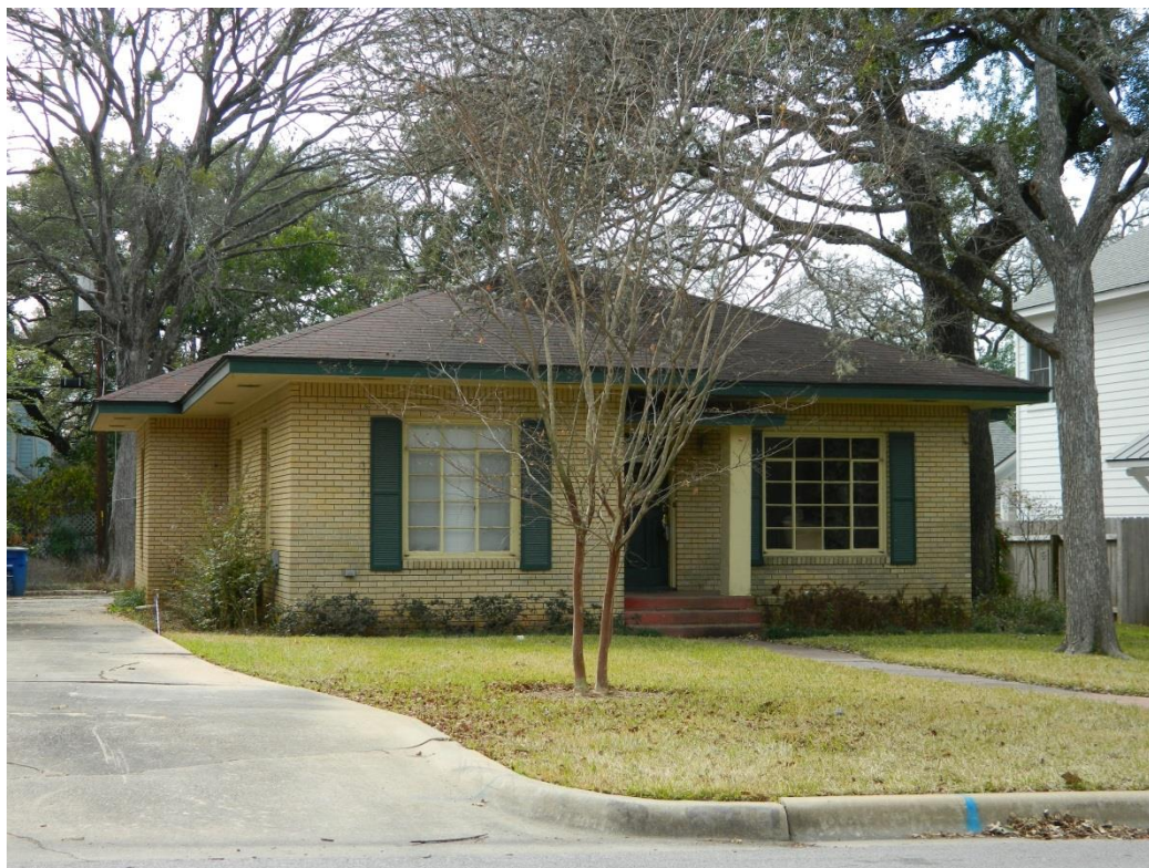
3215 Bridle Path ca. 1949